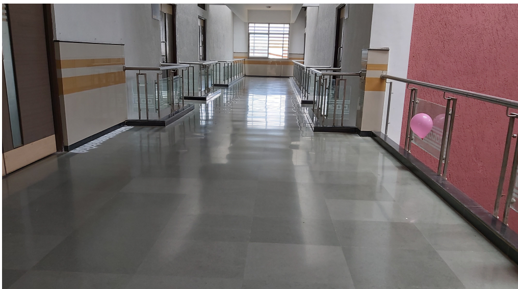
Department was cleaned by the students