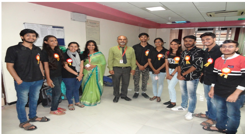
Team of students to clean the department