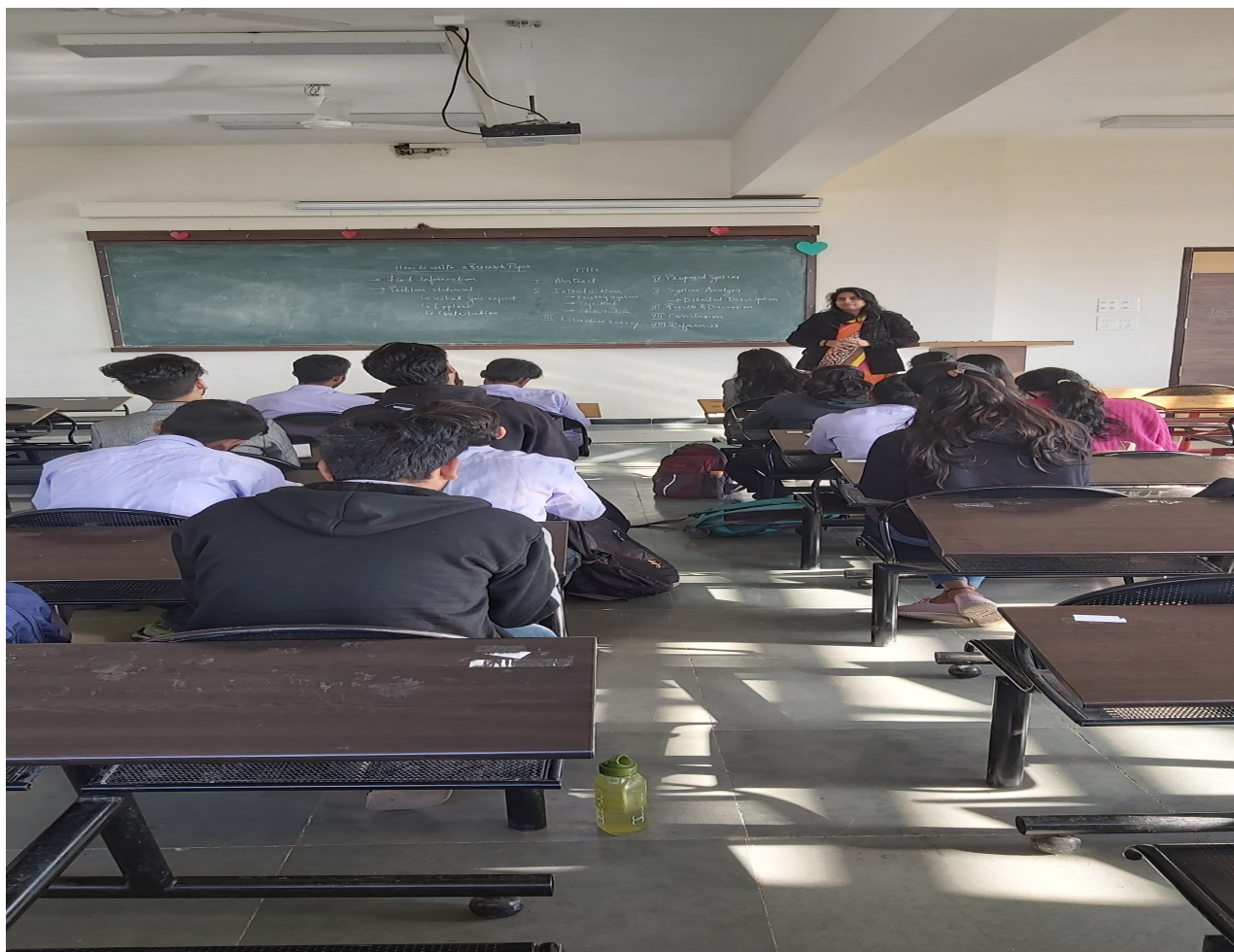
Interaction with students