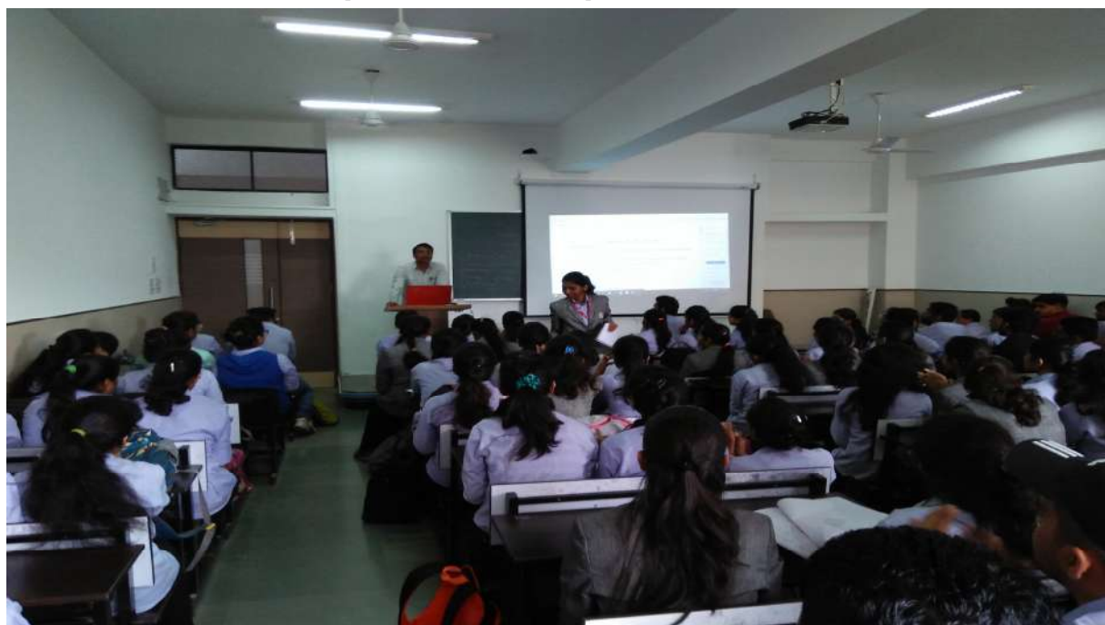
Photograph during elaborating the LP- I Assignments