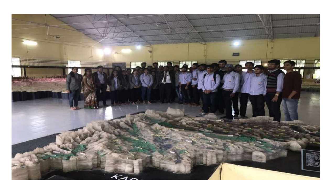
VISIT AT MAHARASHTR PROTOTYPE,MERI