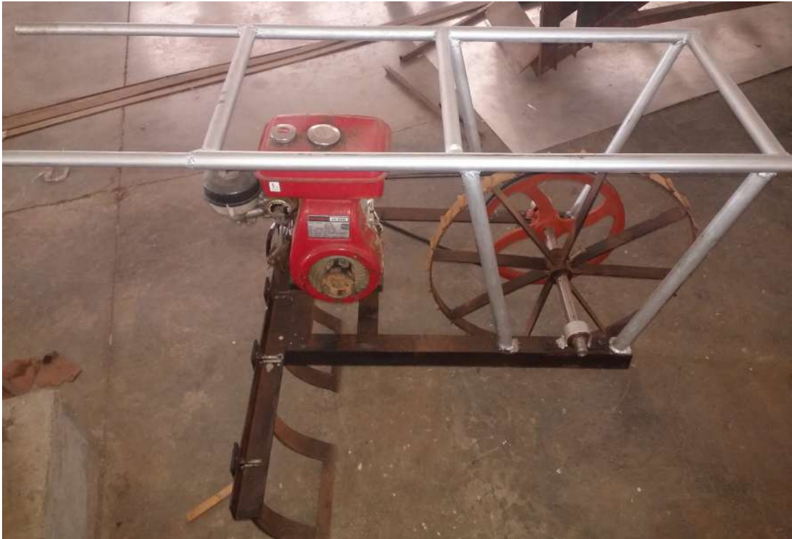
AUTOMATIC CRAMPS MACHINE