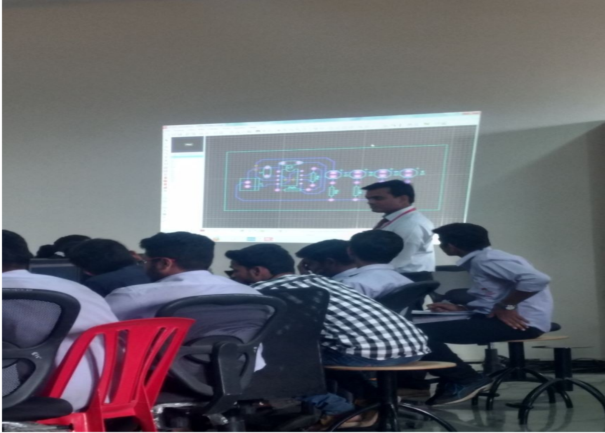
Students learning layout design for PCB