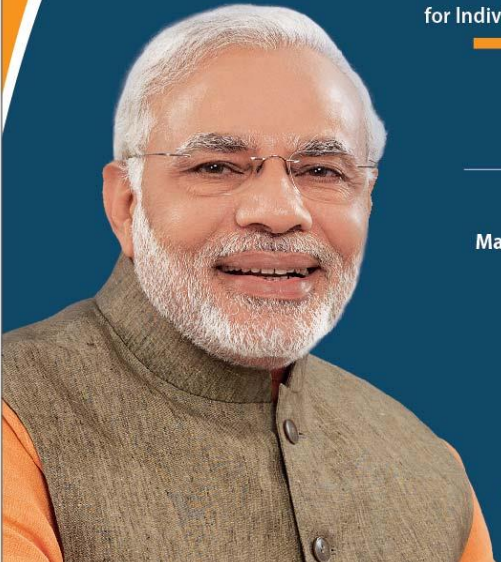
NARENDRA MODI PRIME MINISTER OF INDIA

Log on to www.neas.gov.in for more information, application & nomination form