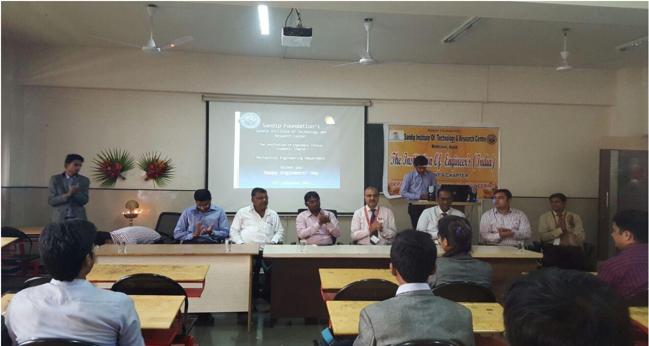
Dignitaries on Dias