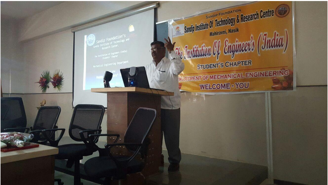
Motivational Guidance by Chief Guest