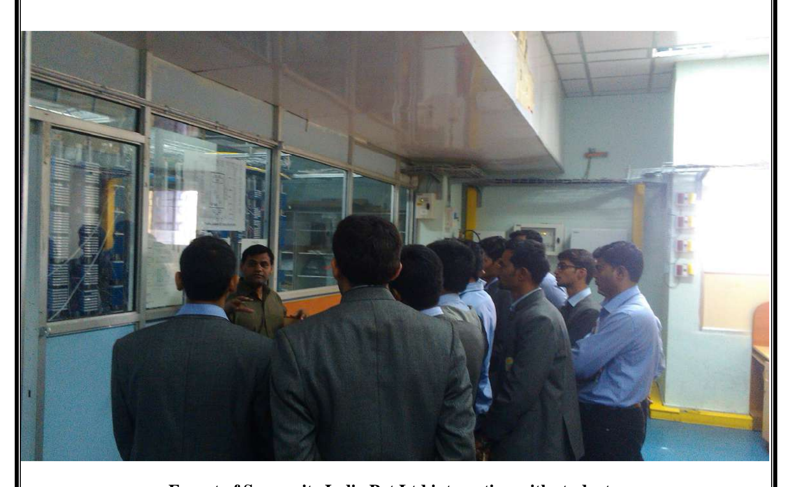
Expert of Samsonite India Pvt Ltd interacting with students