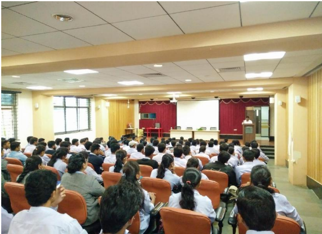
Student keenly listening to the guidance delivered by the Speaker.