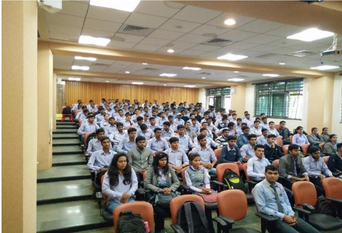
Student of SE & TE Electrical Engineering along with Staff Attended the Guest Lecture