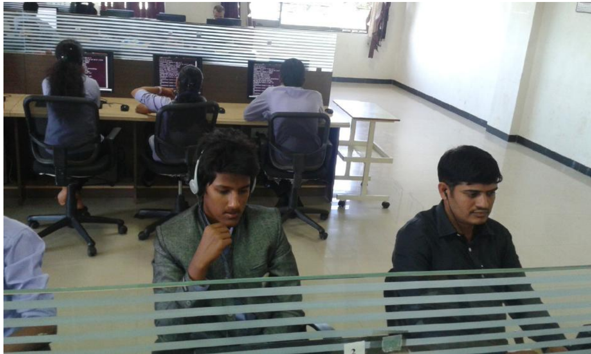
Students and Staff while attending Spoken Tutorial Training Workshop