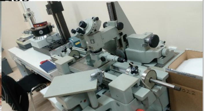
Project Work of students in Laboratories with Faculties