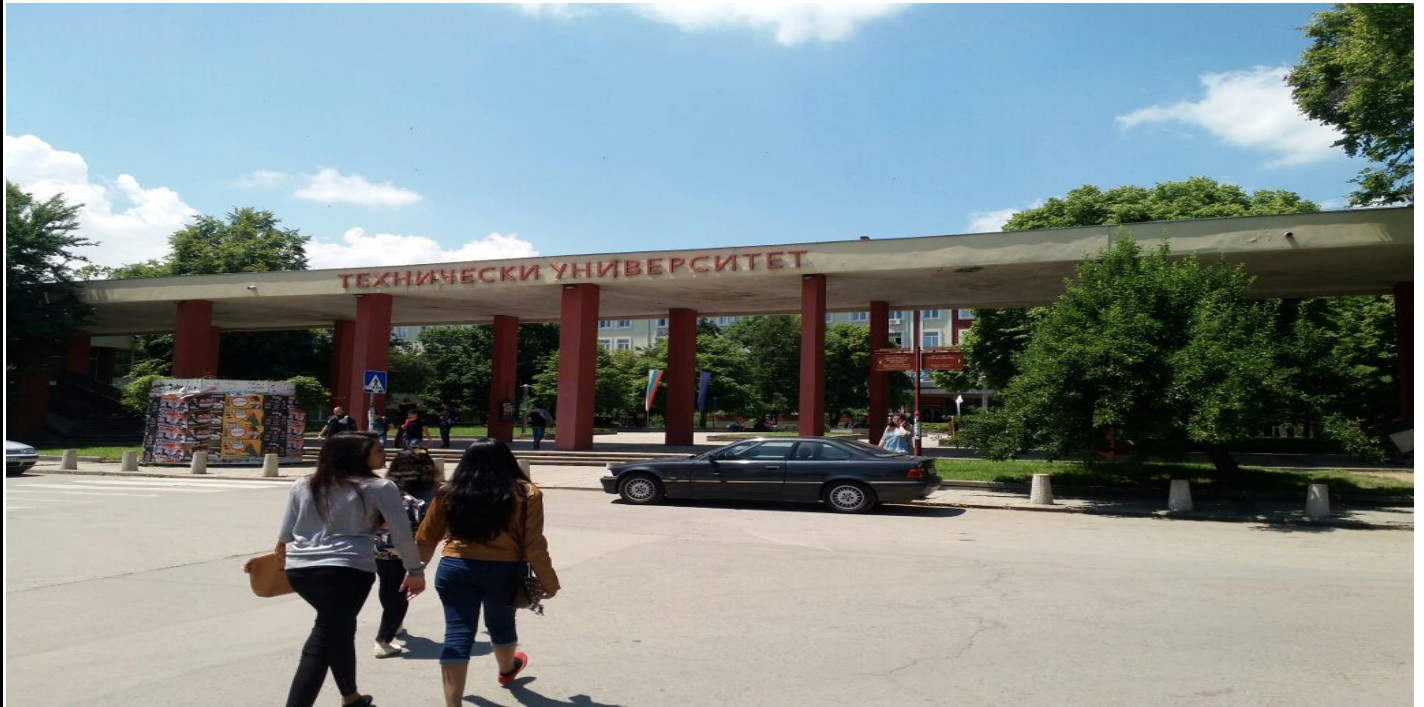
Entrance of Technical University of Sofia, Bulgaria.