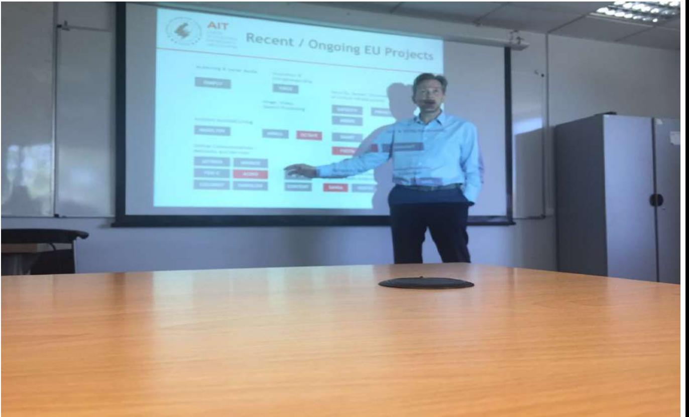
Lecture delivered by Head of Department