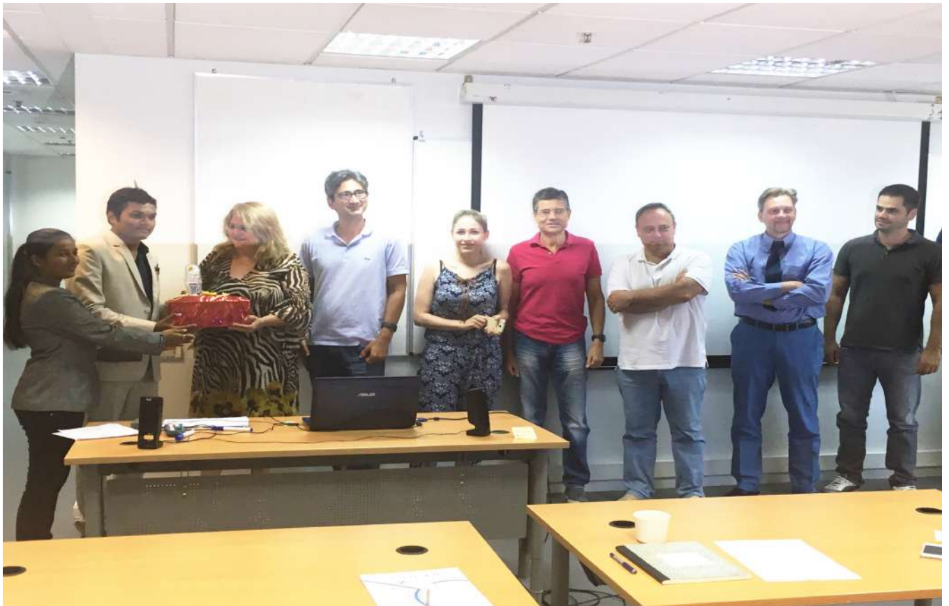
Felicitations on last day at AIT, Athens, Greece