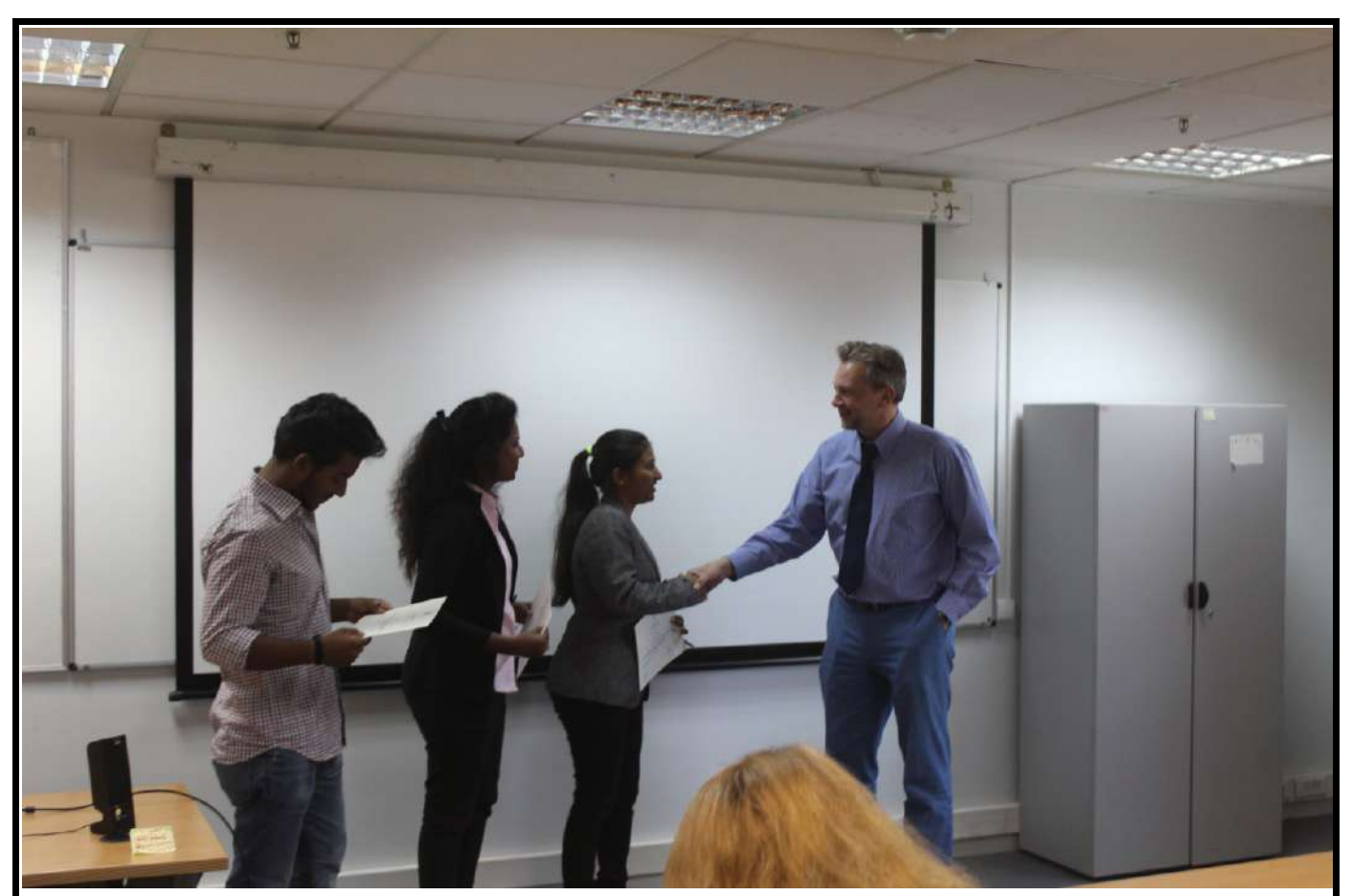
Felicitation on last day at AIT, Athens, Greece