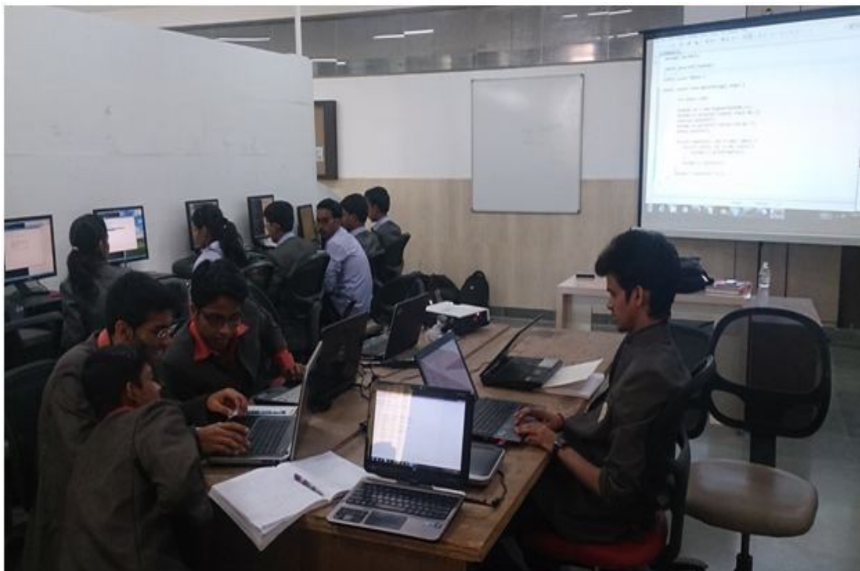
Photographs during the Session