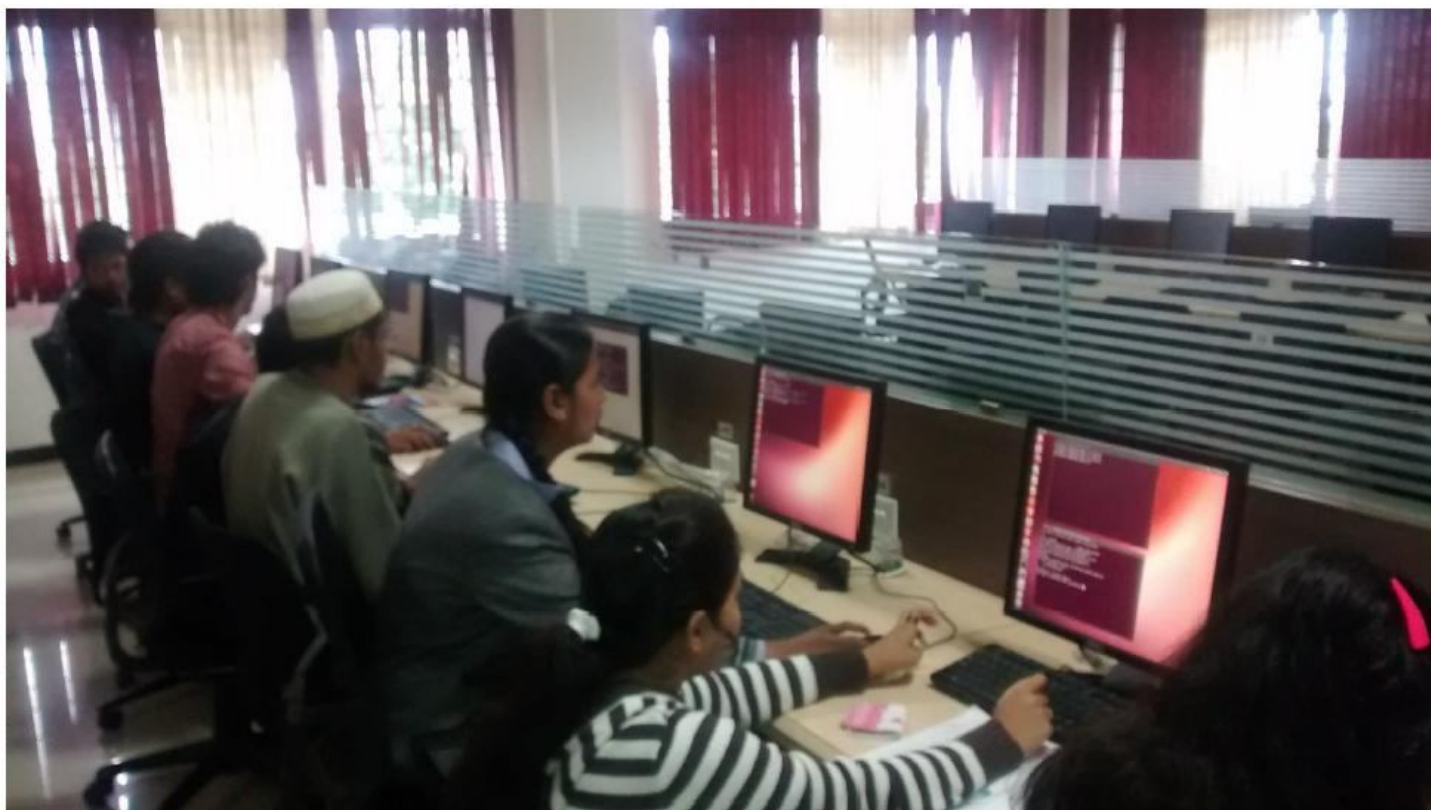
Photographs during the Session