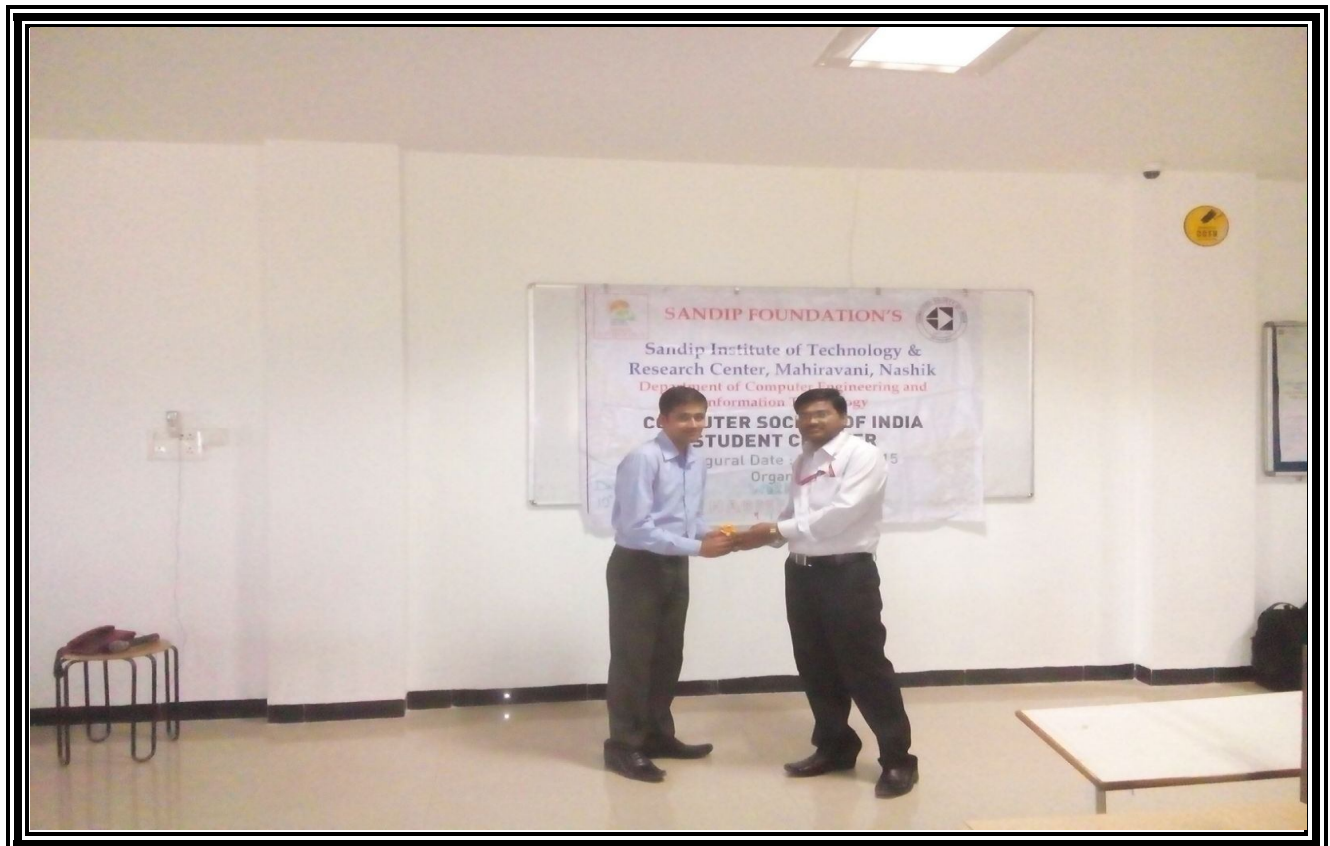
Felicitation of Resource Person