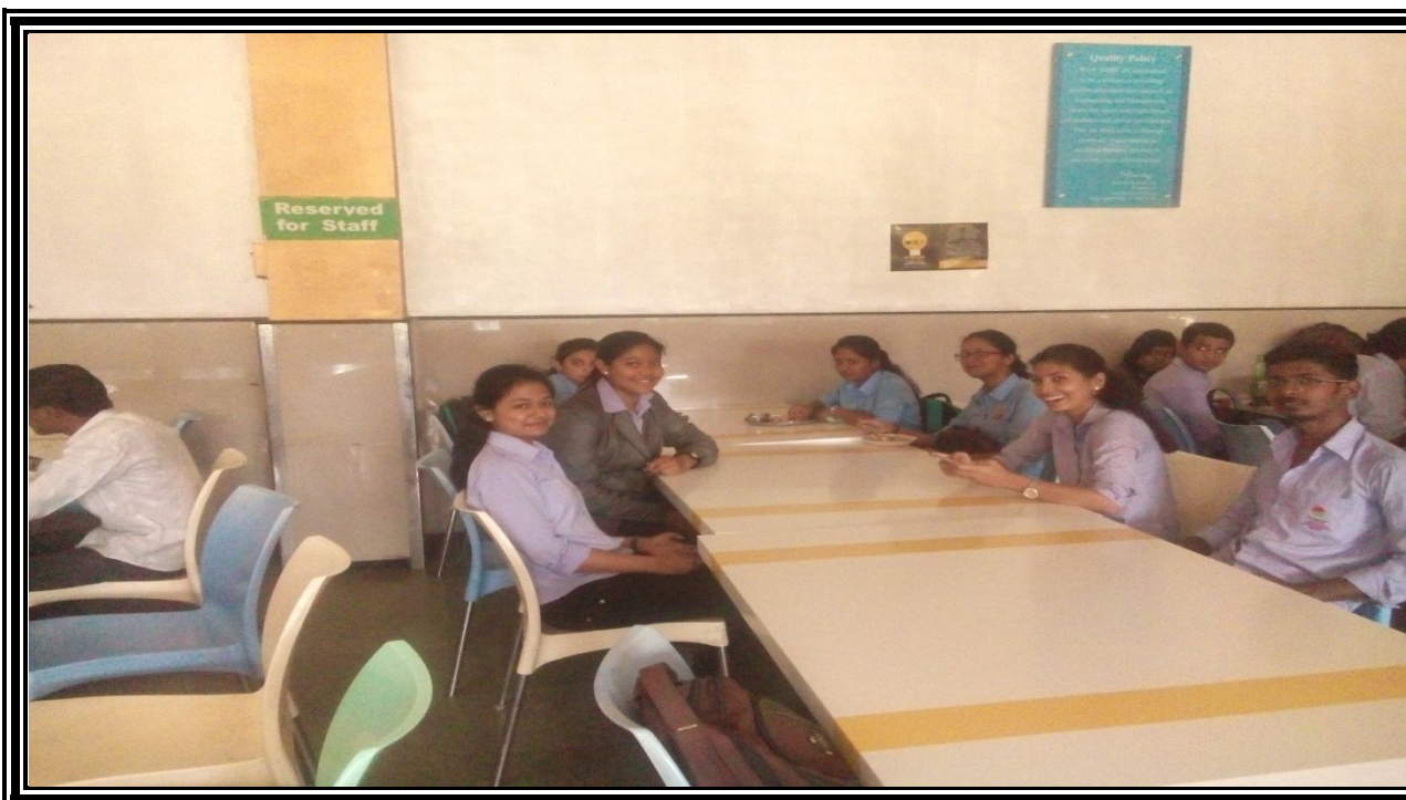
Students in canteen for Lunch arranged in workshop