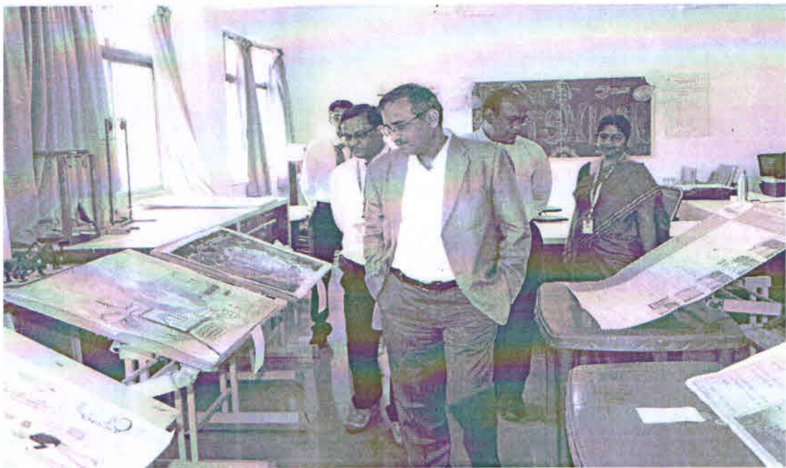
Principal Sir Evaluating all the Posters