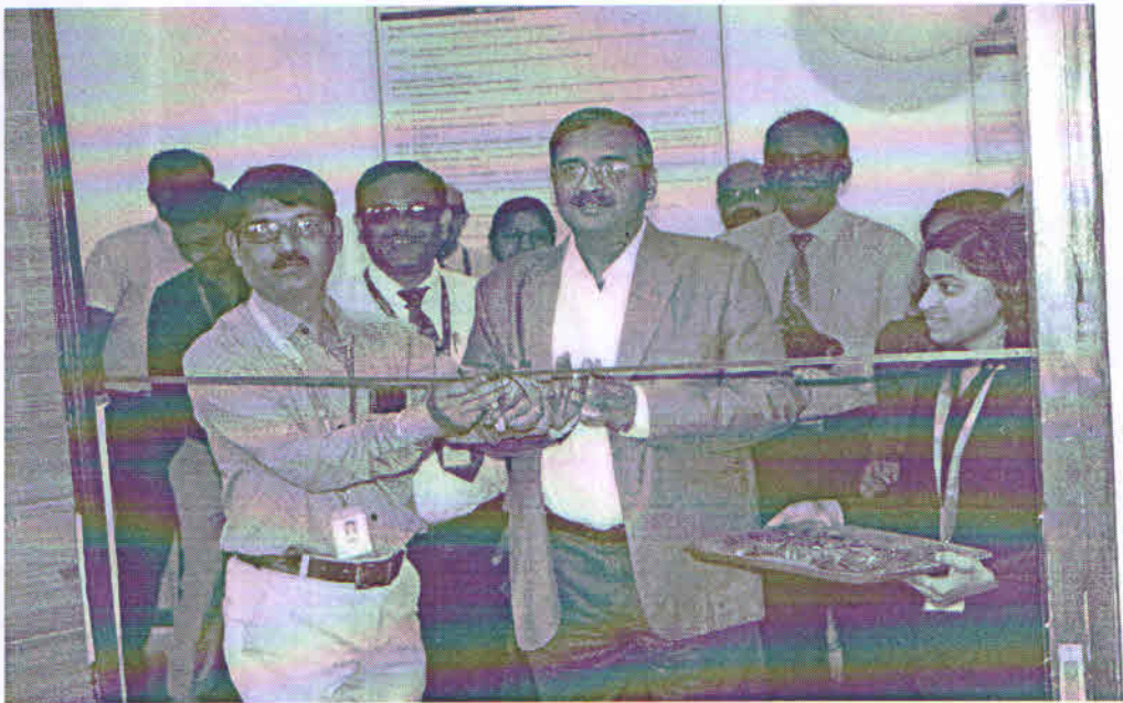
Ribbon Cutting and Inauguration of Poster Presentation Competition