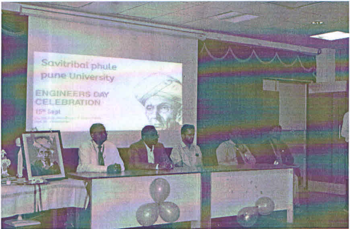
All dignitaries on the dais