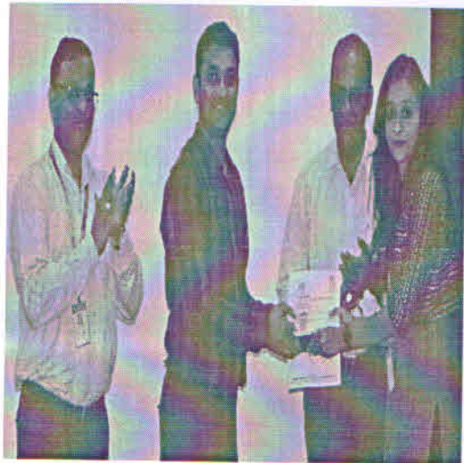
Photo: Prize distribution to winners of essay competition