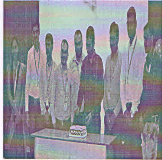
Photo: Teachers Day Celebration