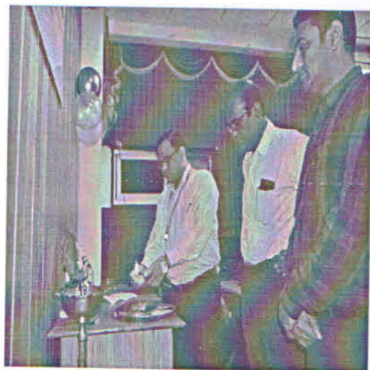
Photo: Teachers Day Celebration