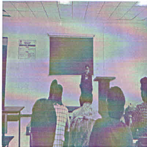
Photo: Students as a Teacher