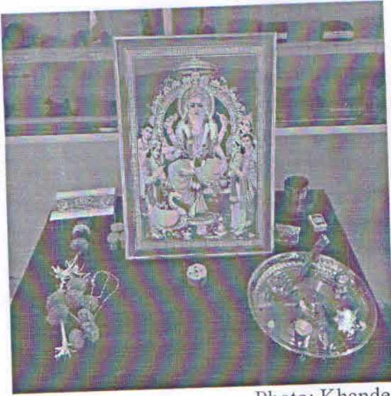
Photo: Khande Navami- AyudhPujan