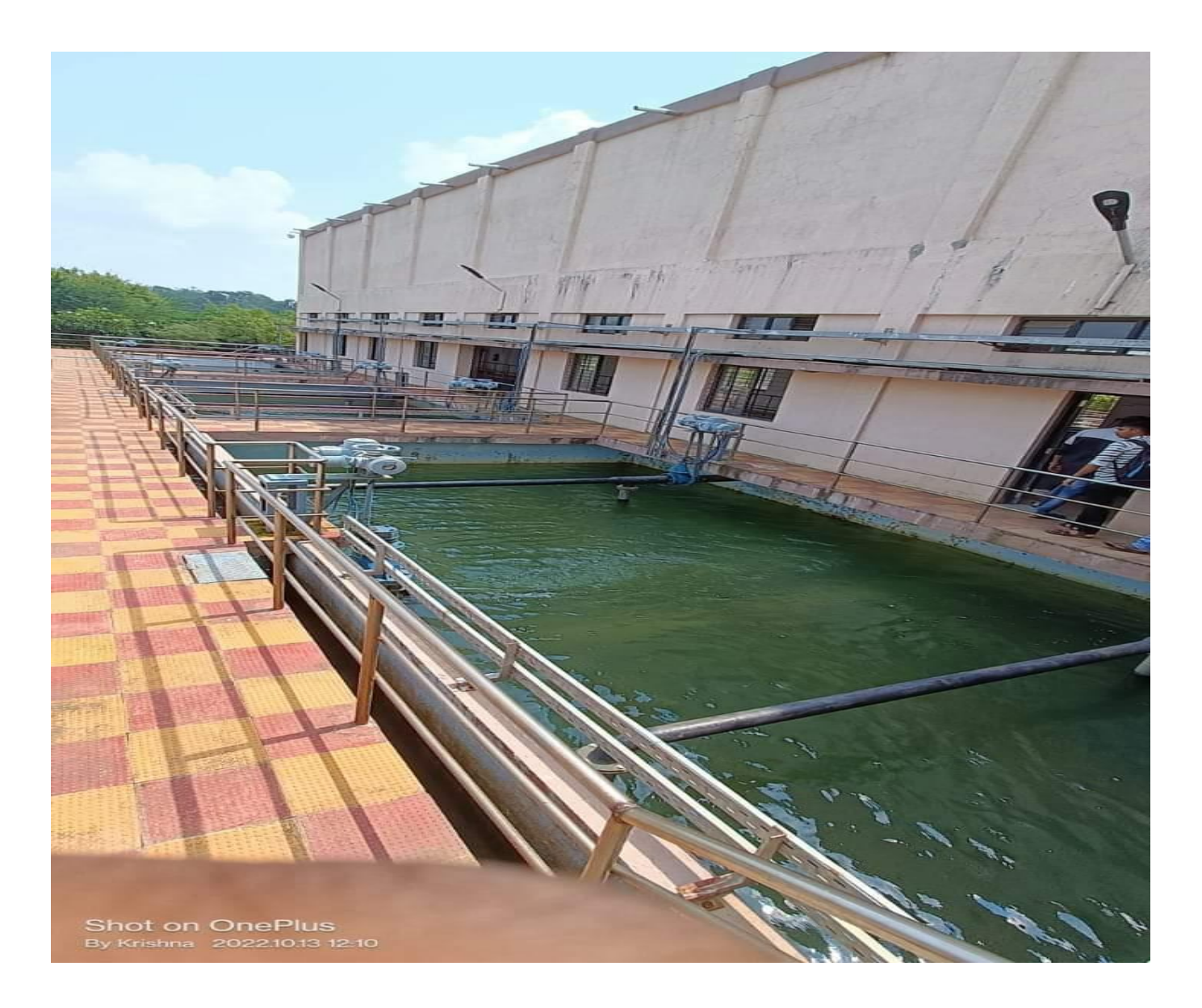
Rapid Sand Filter Under Regular Opearation