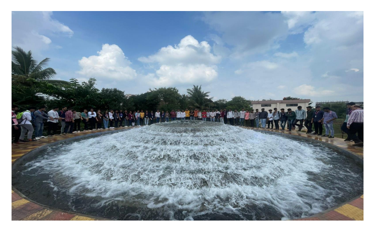
Cascade Aerator View at WTP