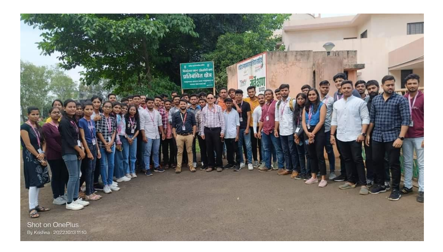
Group Photo at Entry GATE of Nilgiribaug WTP

Like Cascade Aerator, Flash Mixer, Clariflocculator, Rapid Sand Filter and Disinfection System.