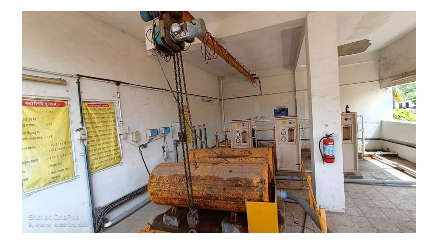
Storage of Chlorine Tank (For Disinfection Process ) at WTP