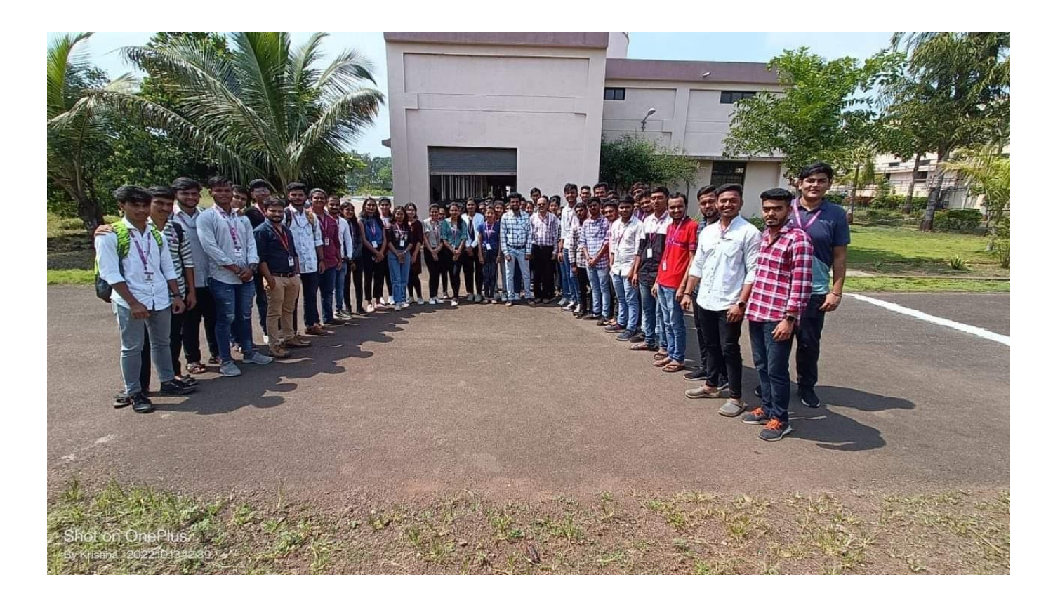
Group Photo with WTP Incharge