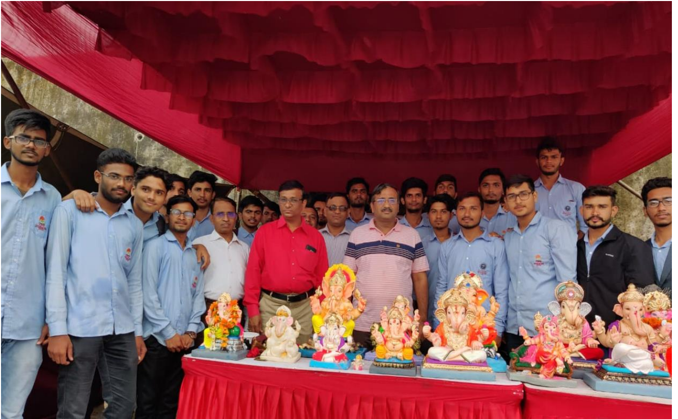
Principal , Dean and HOD visited and motivated NSS volunteers