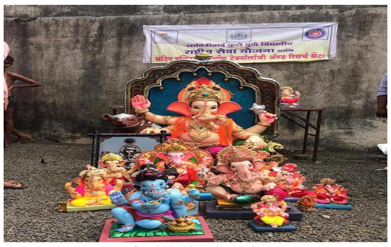
Ganesh Murti donated by people