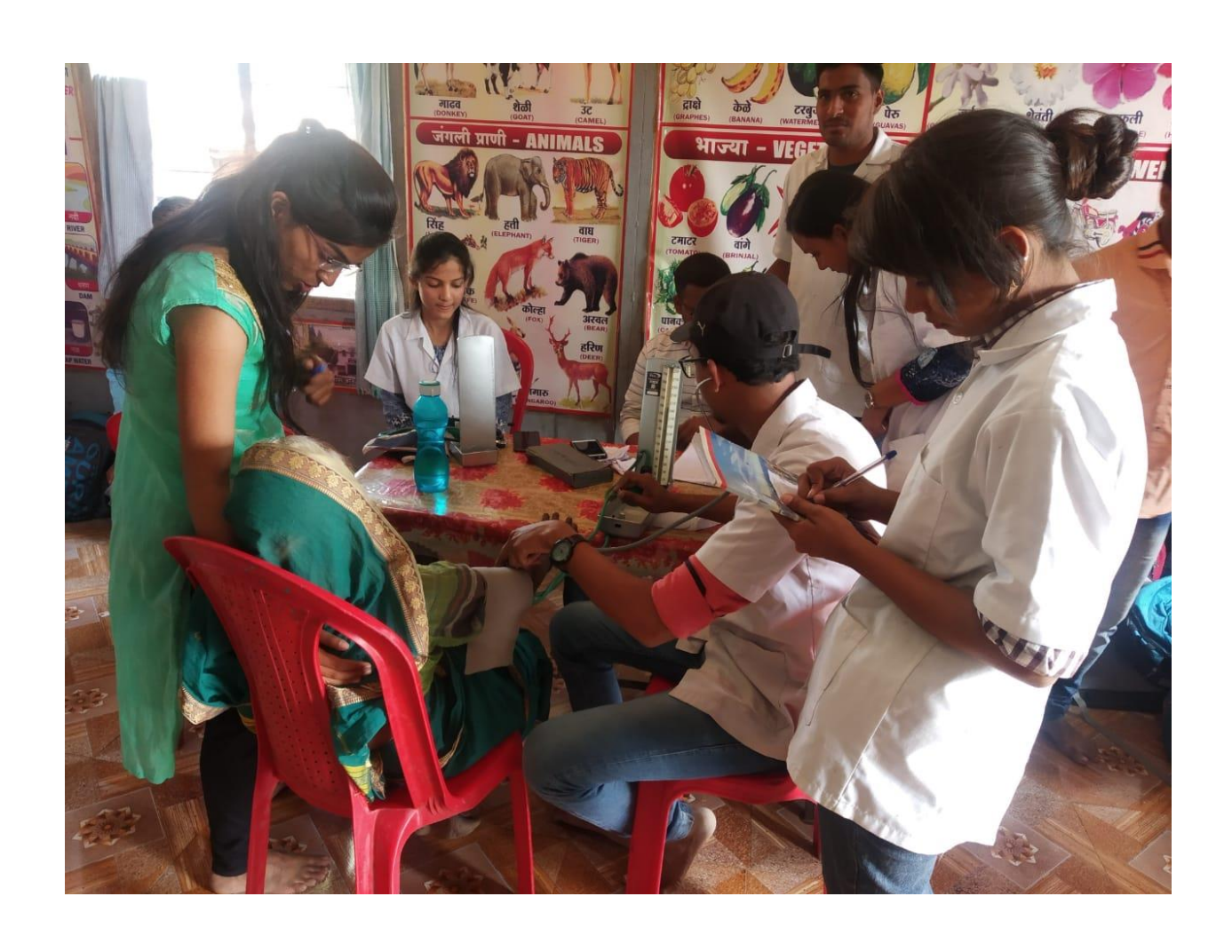
Health Checkup Photos