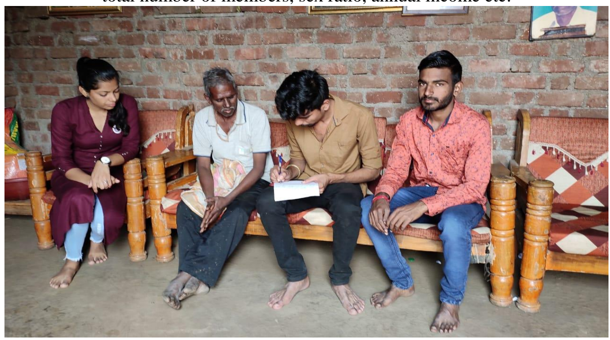
Suevey by Students

Survey of village done by students regarding educational background of families, total number of members, sex ratio, annual income etc.