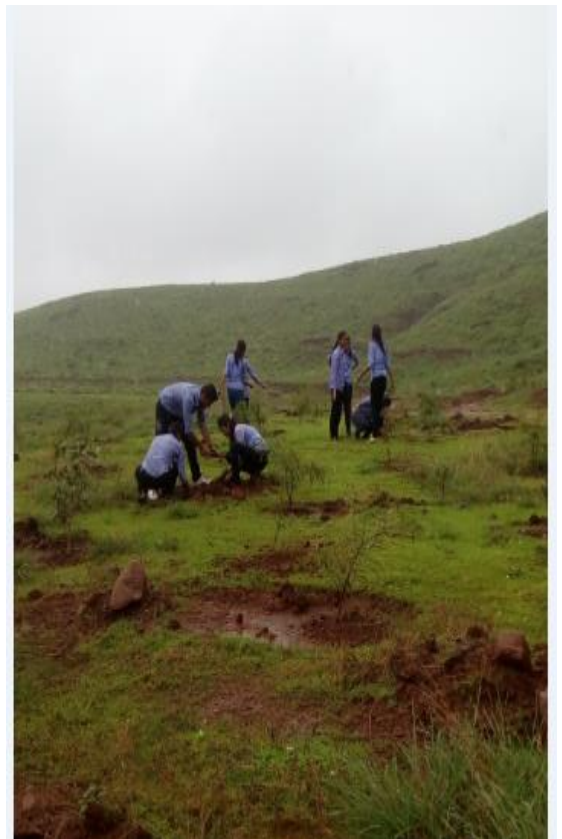
Student volunteers doing the tree plantation