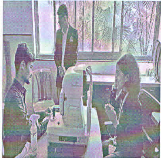
Photo: Eye Check up