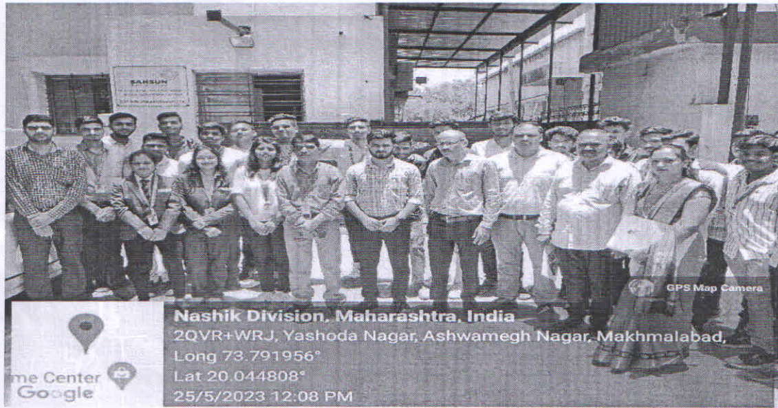
Technical Team Members of SANSUN India Pvt.LTD along with Staff and Students.