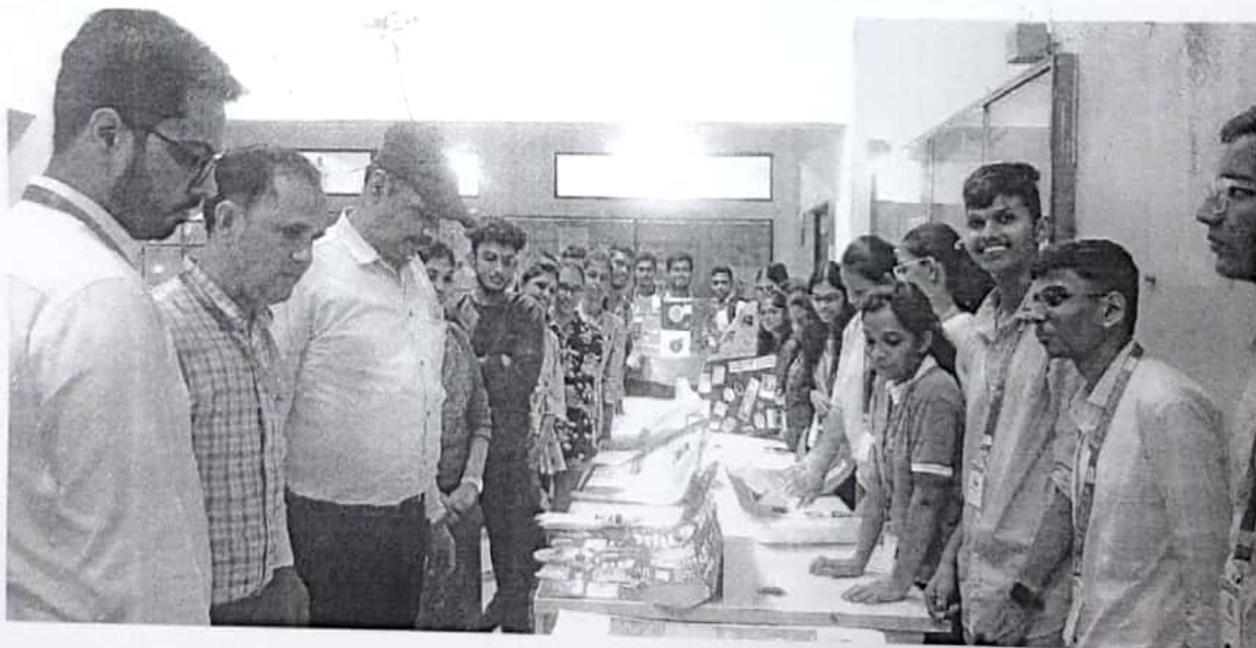
Evaluation of Poster by HOD of ESH and Judges