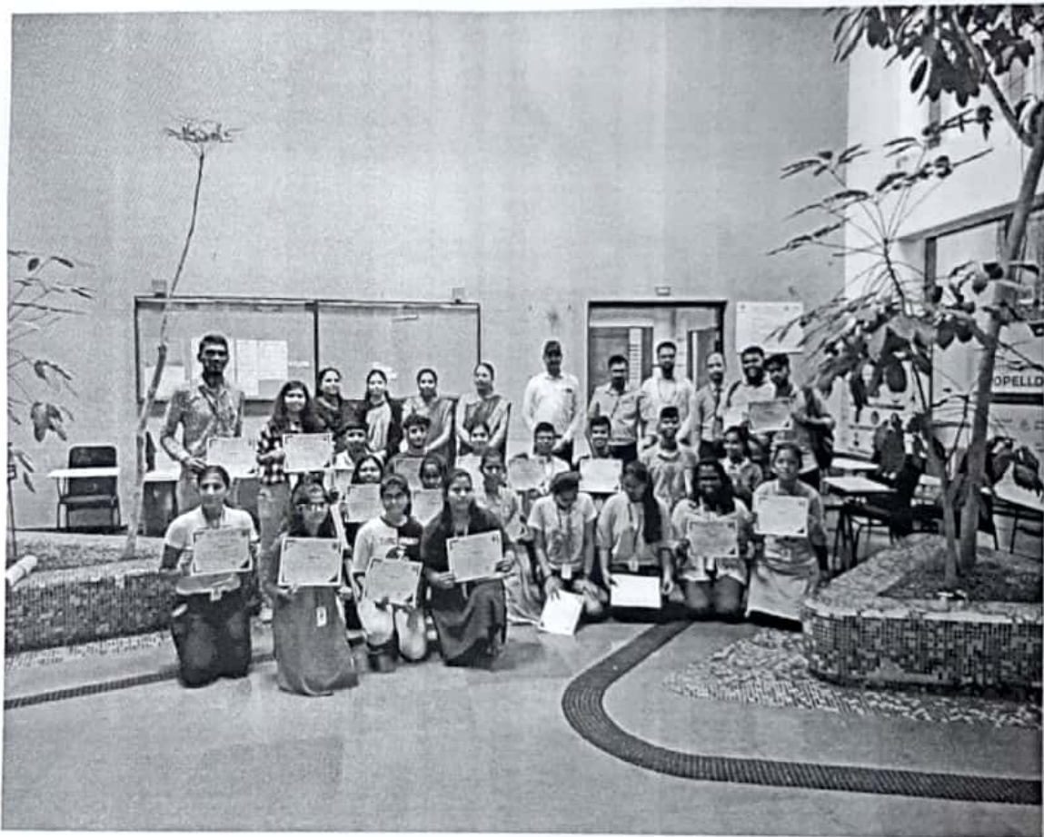
Participants students with faculty of ESH