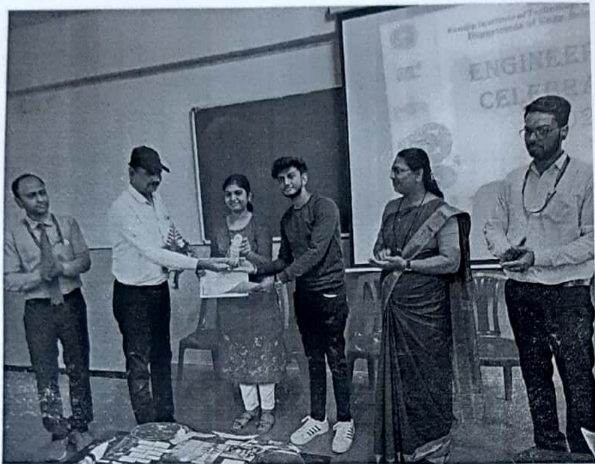
Felicitation of Winner by HOD of ESH