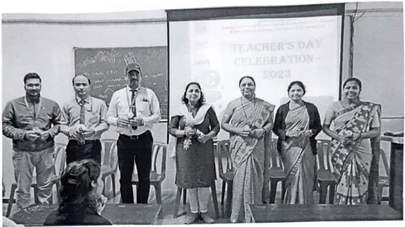
Students Felicitated Teachers