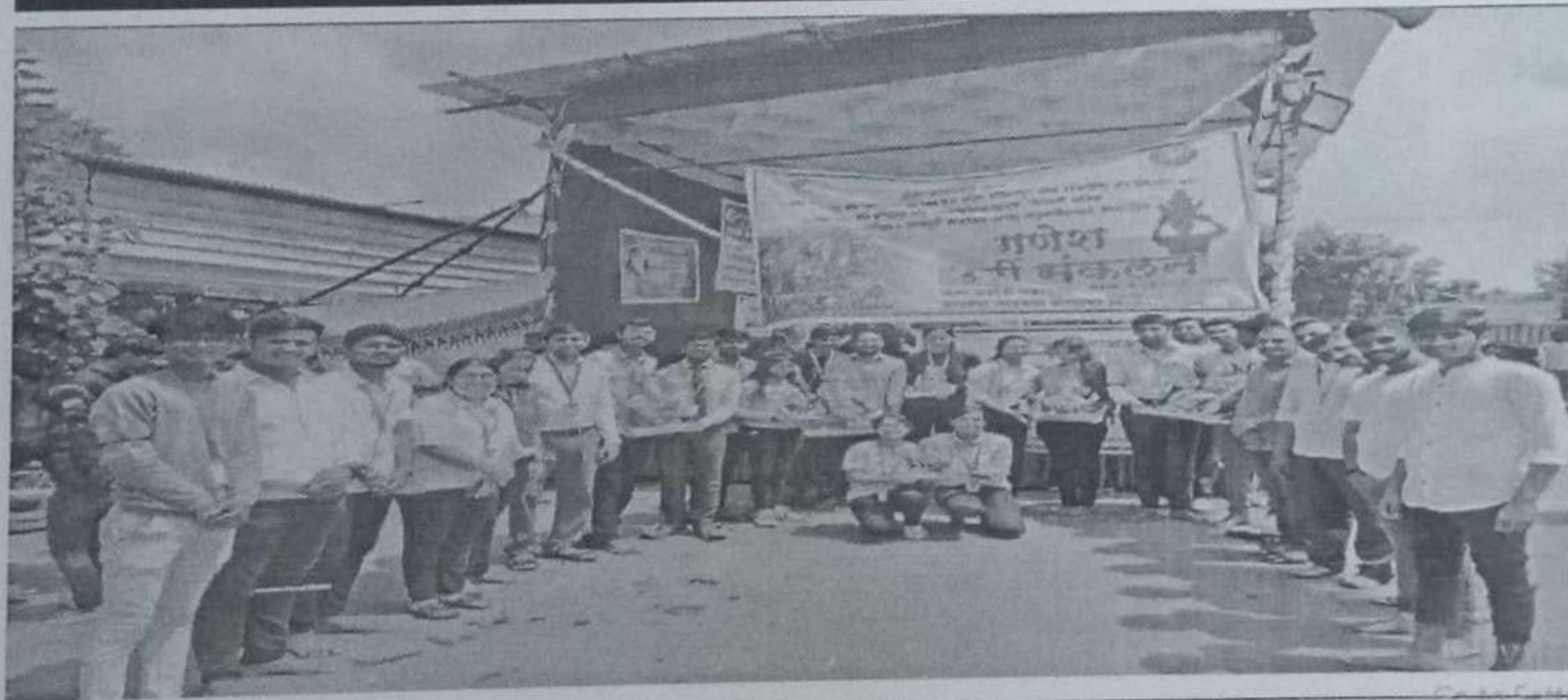
Students and Staff of SITRC, Nashik