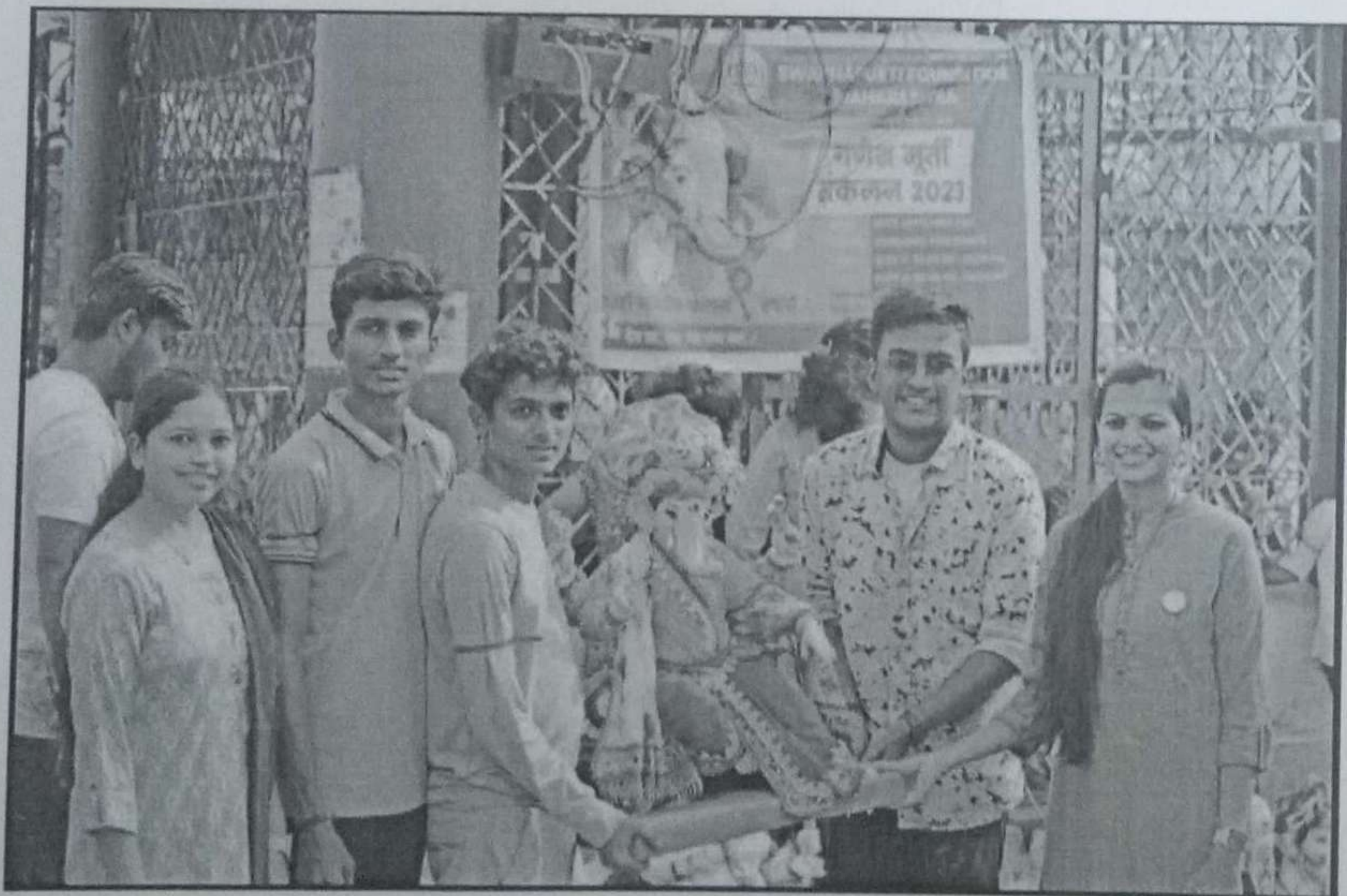
Students and staff while collecting Ganesh Idol