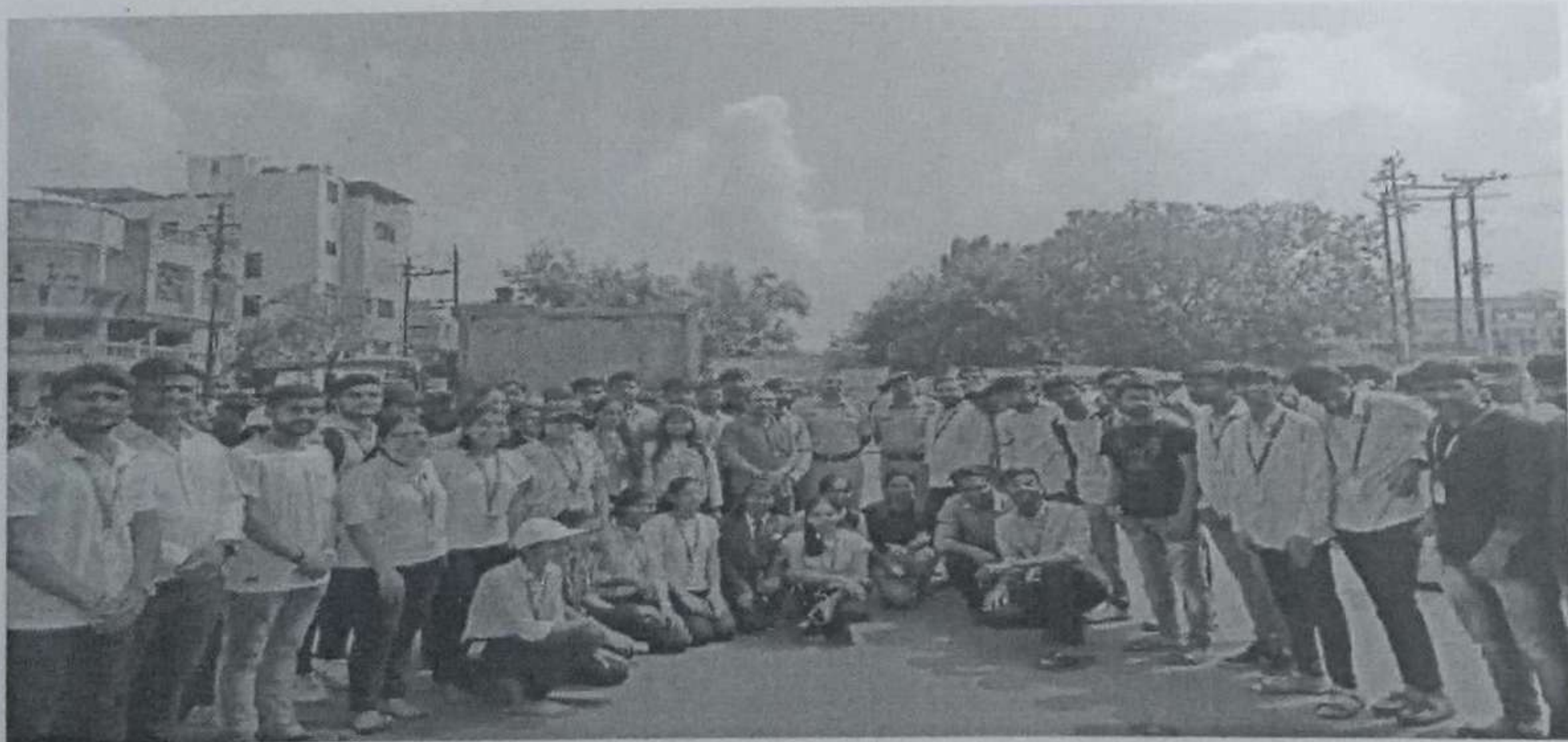
Inauguration of Ganesh Murti Collection.