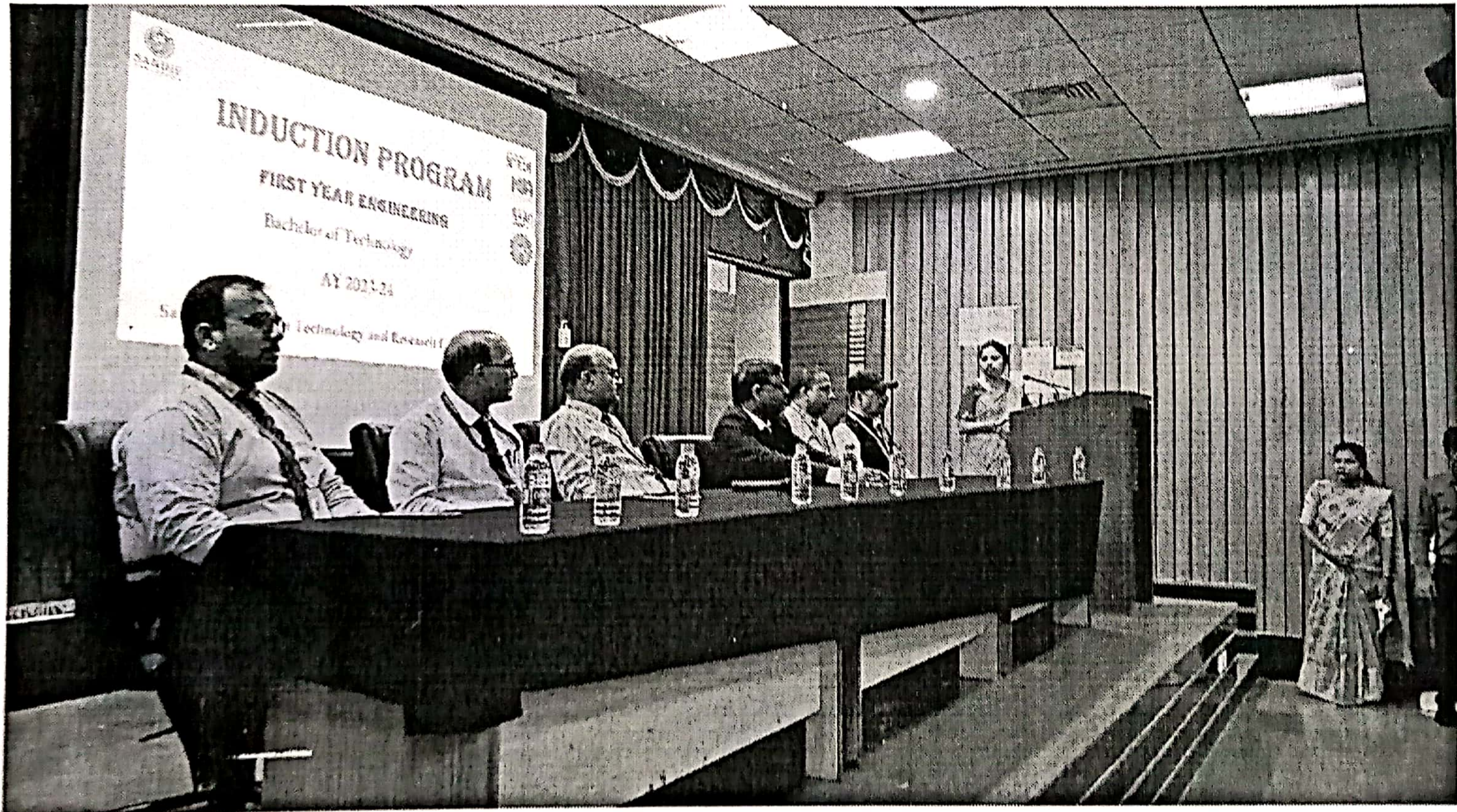
All the dignitaries