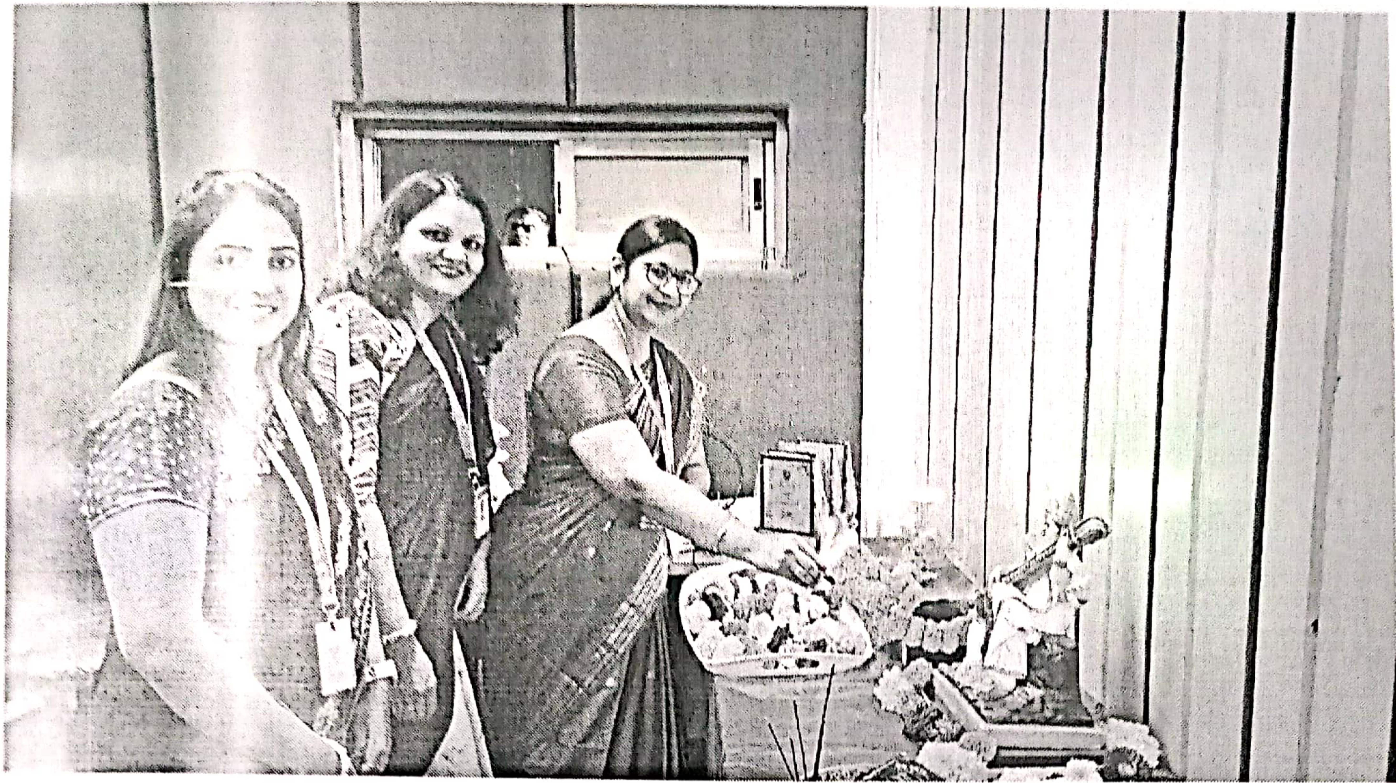
Inaguration of Induction Programme