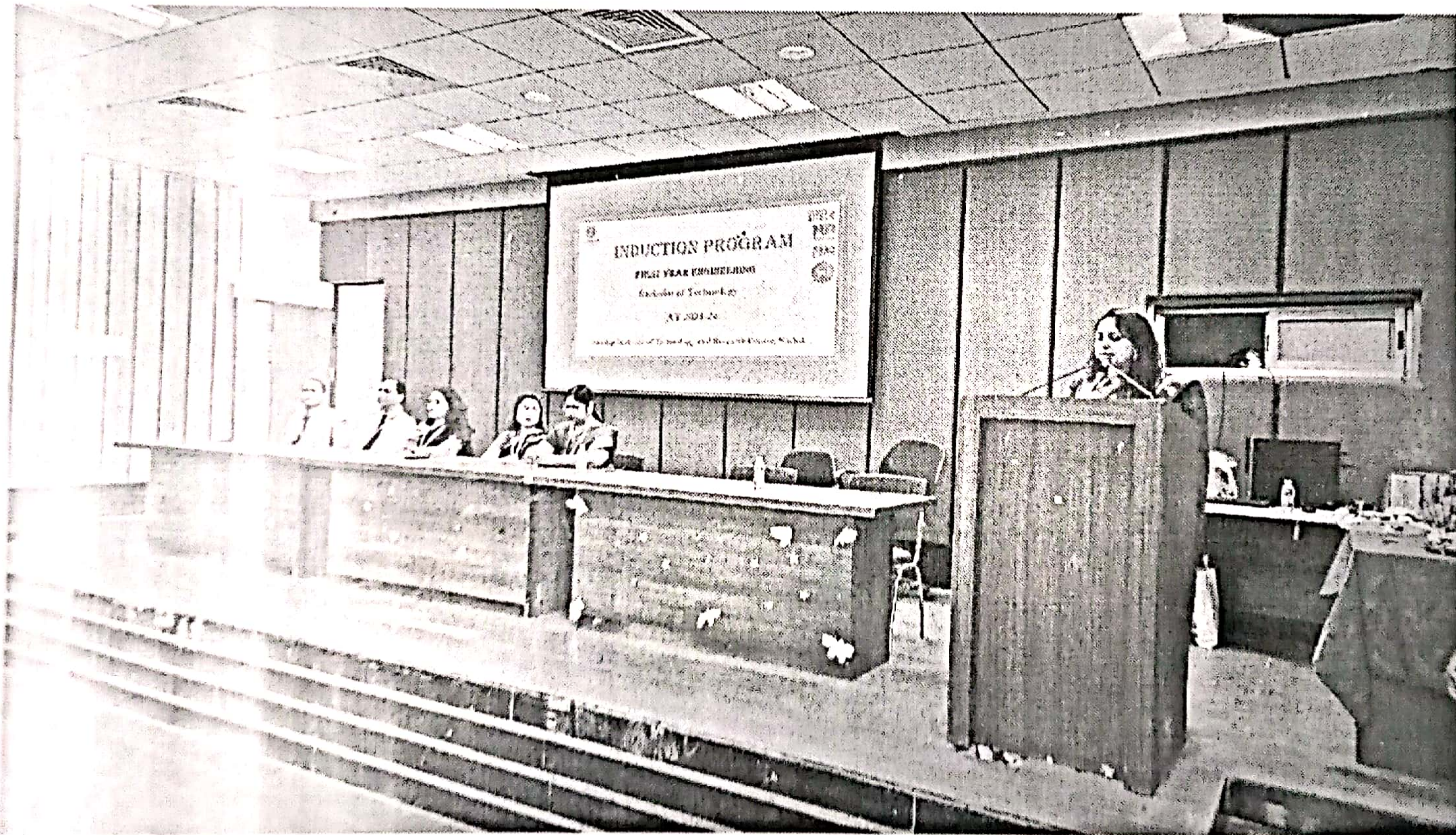
Introduction of Guest