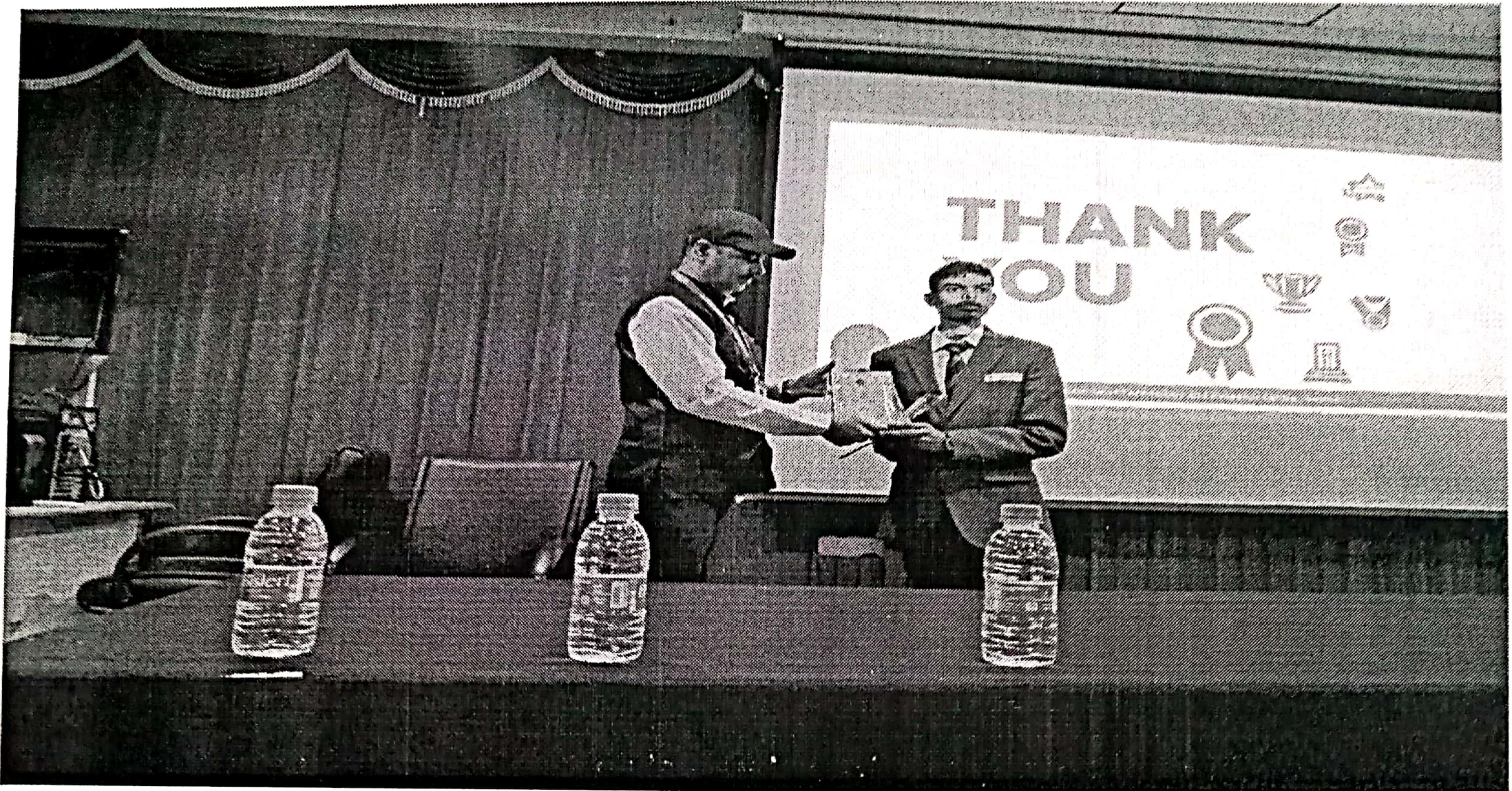
Feliction of Toppers