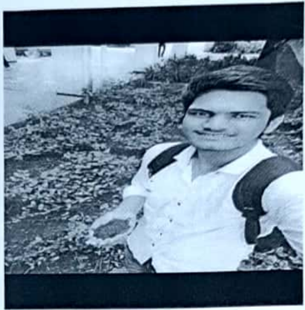
Students Participated into "Meri Mati Mera Desh" activity and clicked the selfie