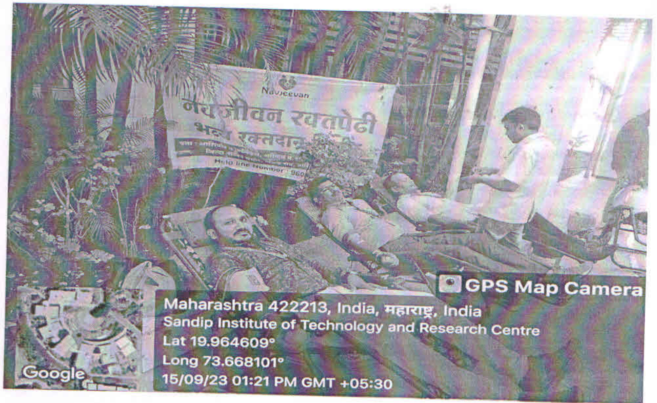
Staff Blood Donors