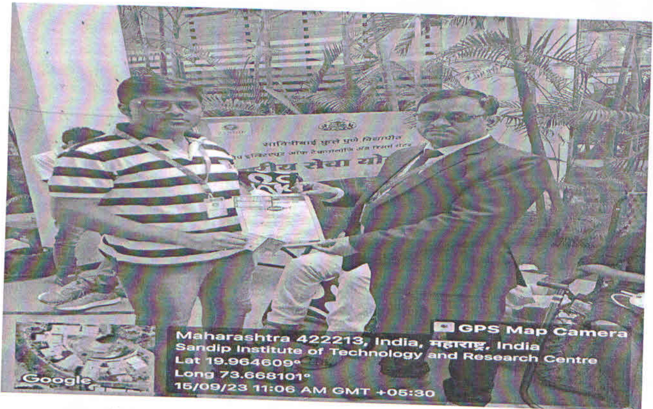
Felicitation of First Blood donor by Principal Sir