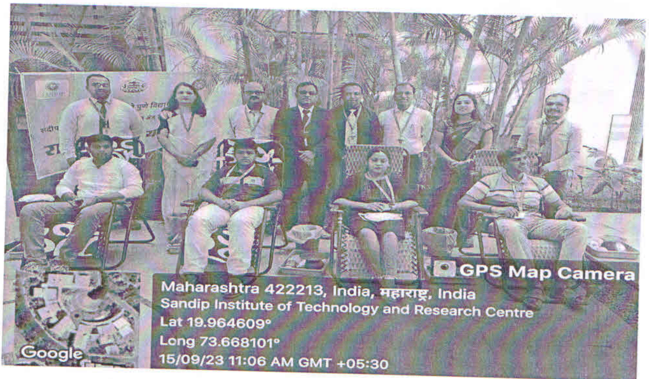
Student Blood Donors