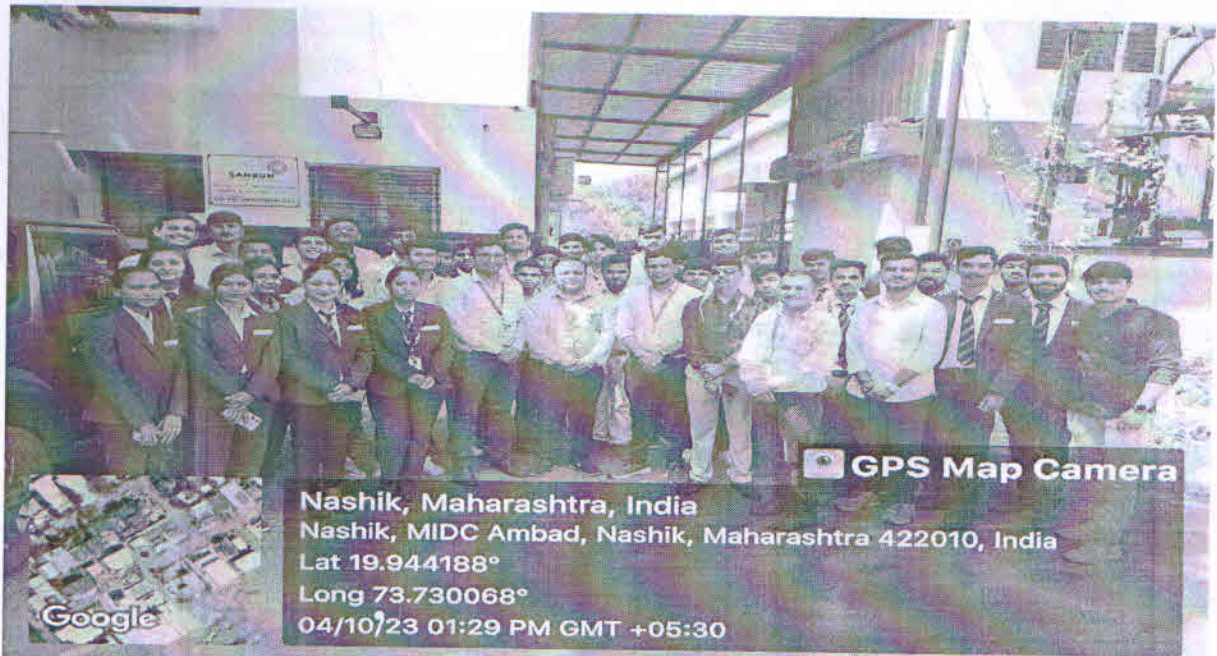
Technical Team Members of SANSUN India Pvt. LTD along with Staff and Students.