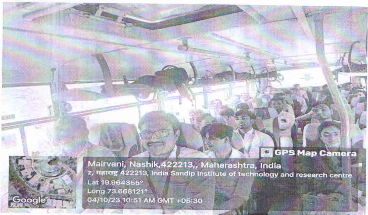
Travelling for Industrial Visit