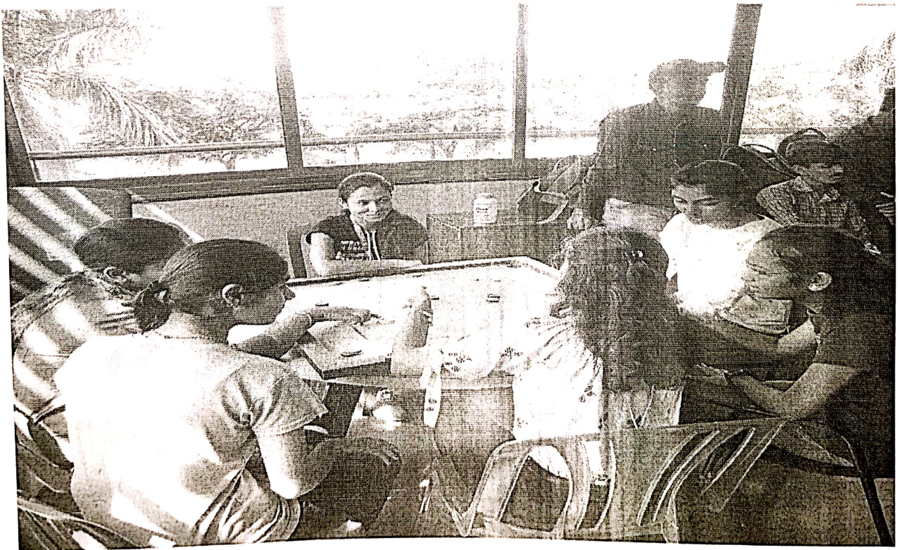
Figure 2: Carrom Board game between girls