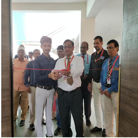
Photo: Inauguration of eye Checkup camp