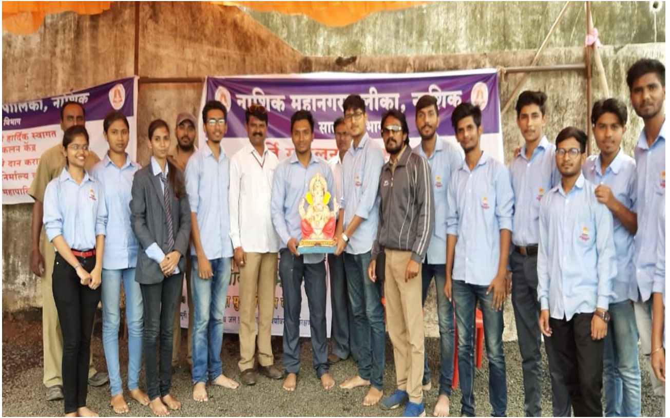
NSS volunteers collecting the Ganesh Murti