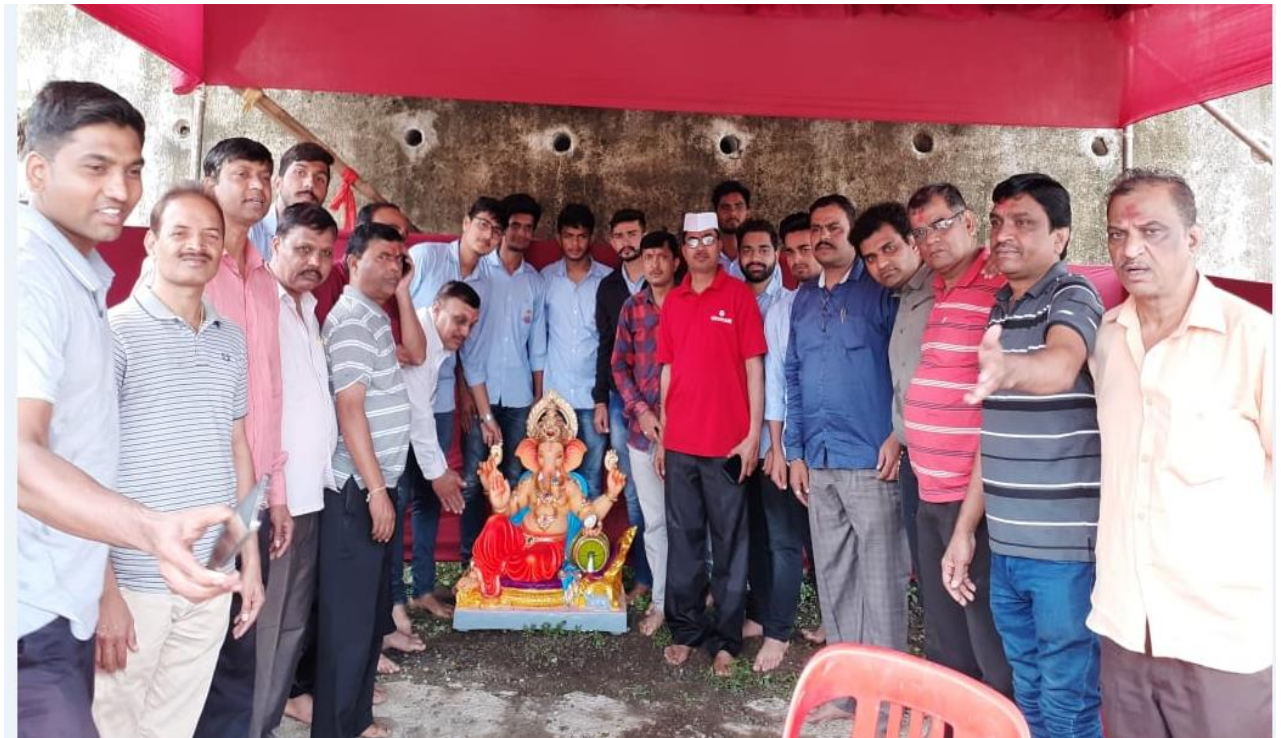
NSS volunteers collecting the Ganesh Murti