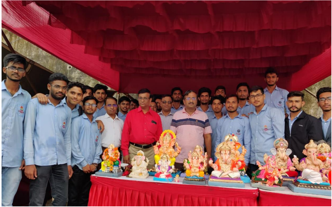
Principal , Dean and HOD visited and motivated NSS volunteers