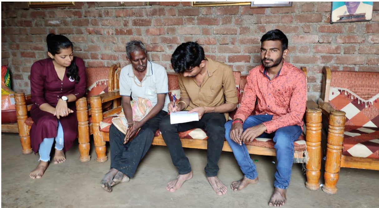
Suevey by Students

Survey of village done by students regarding educational background of families, total number of members, sex ratio, annual income etc.