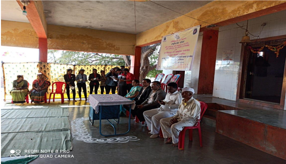
Photo Inauguration of NSS special camp 2019-20

Survey of village done by students regarding educational background of families, total number of members, sex ratio, annual income etc.