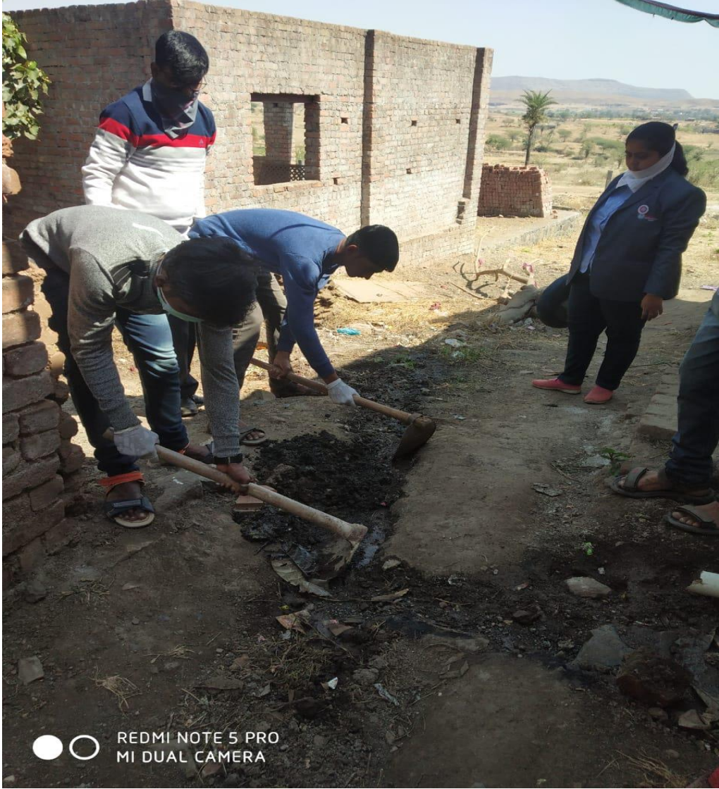
Photos of Cleanliness Drive