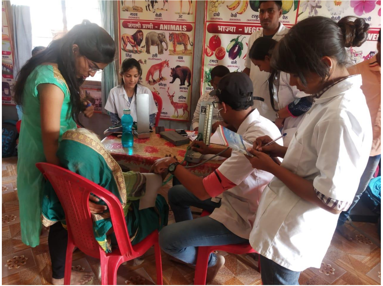
Health Checkup Photos