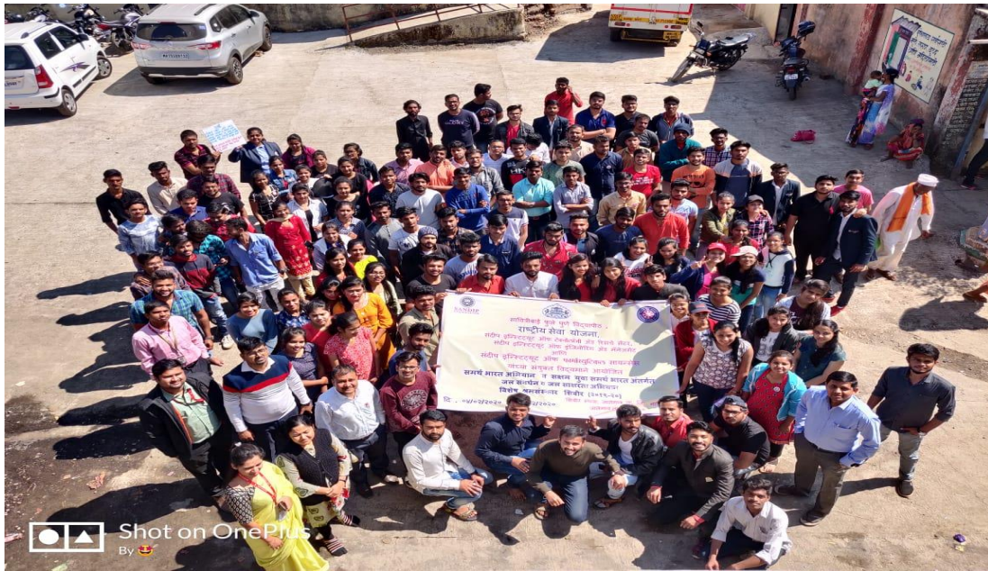
NSS Student Volunteers