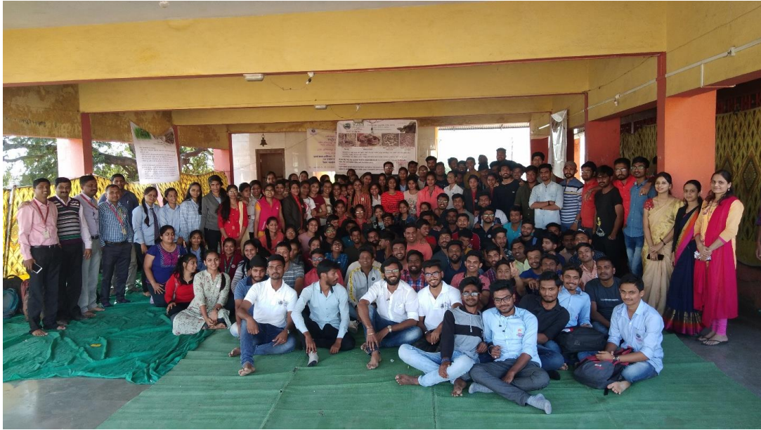
NSS Student Volunteers