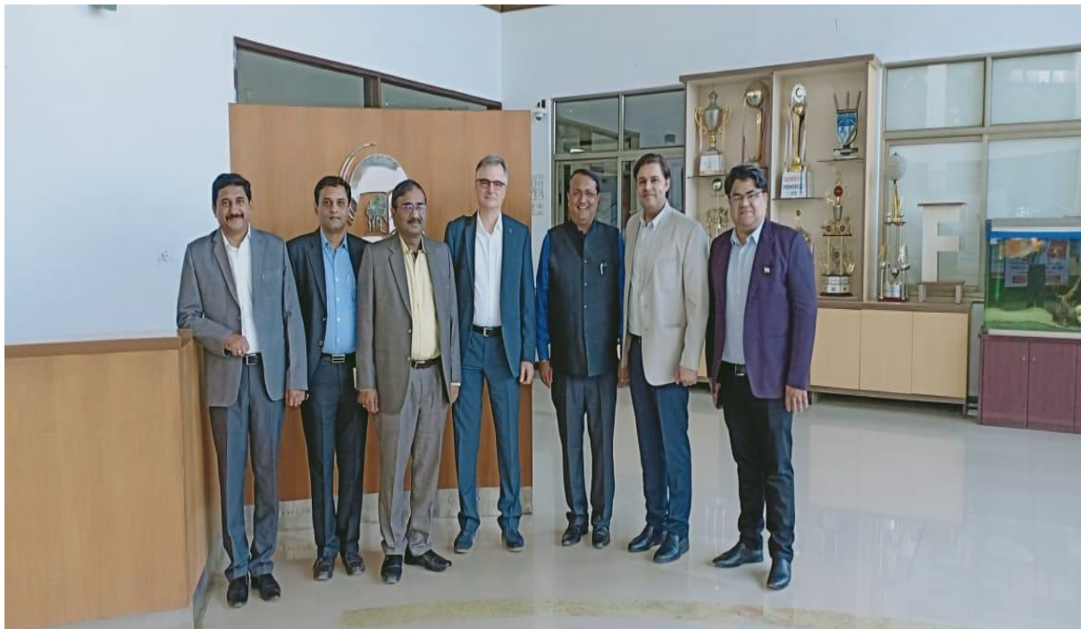
Members Present For the Visit:-