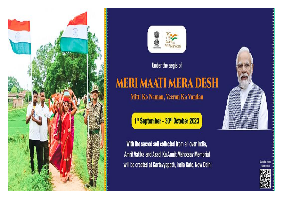
Banner Meri Mati Mera Desh