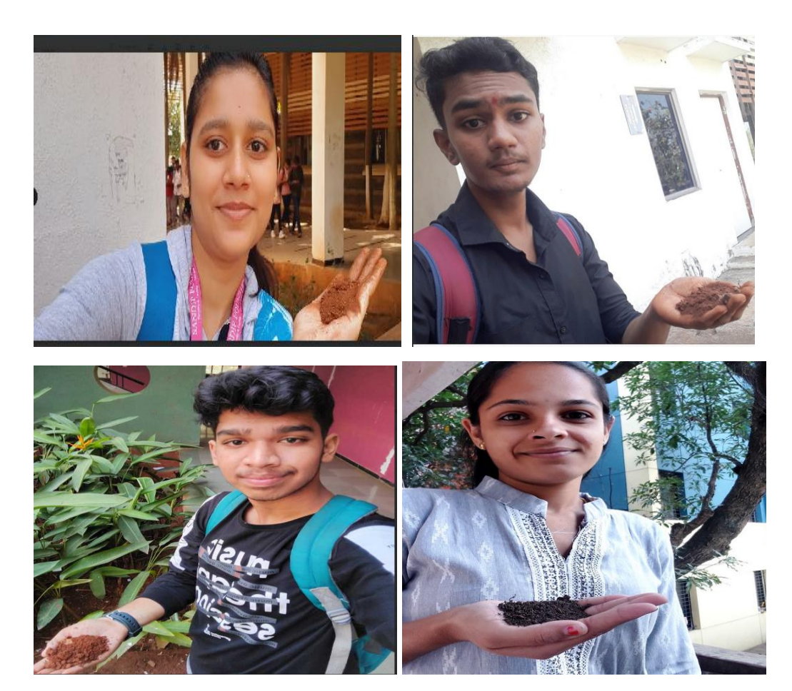
Selfie with Meri Mati