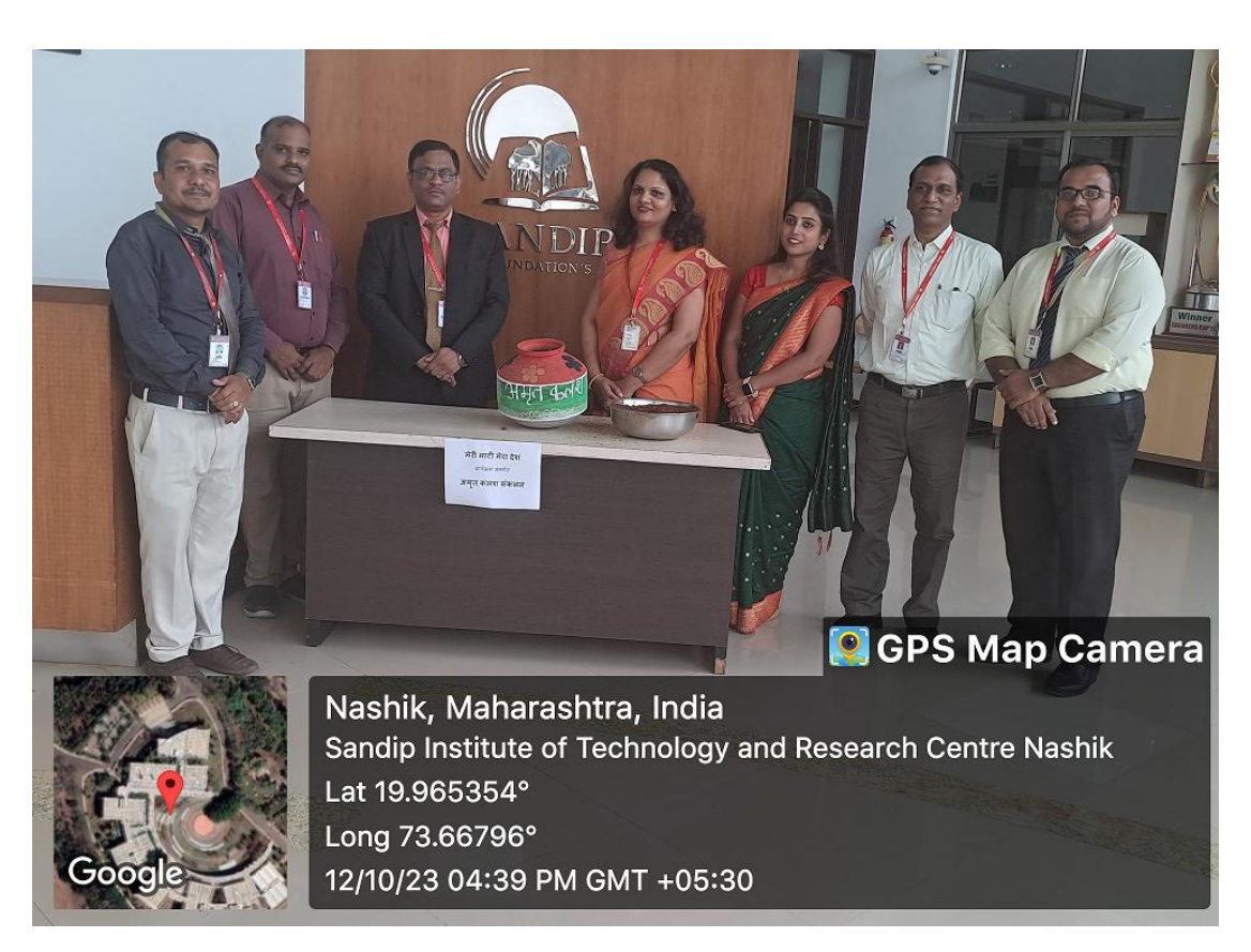
Amrut Kalash Pujan at College Campus