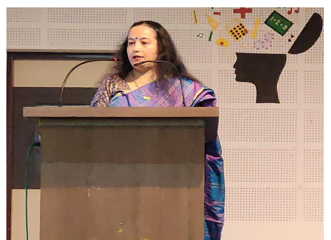
Guest Speaker Adressing The audience