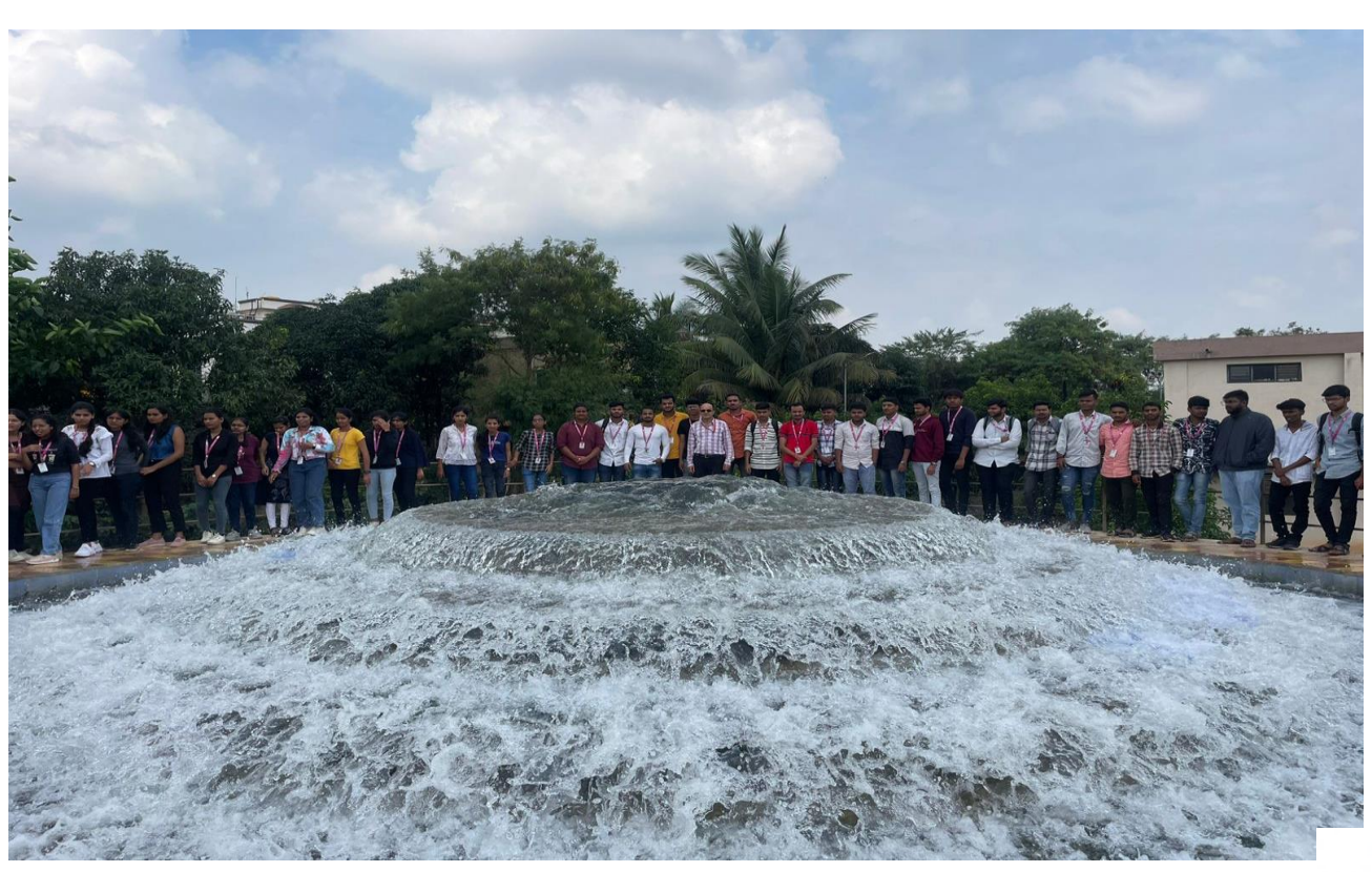
Cascade Aerator View at WTP