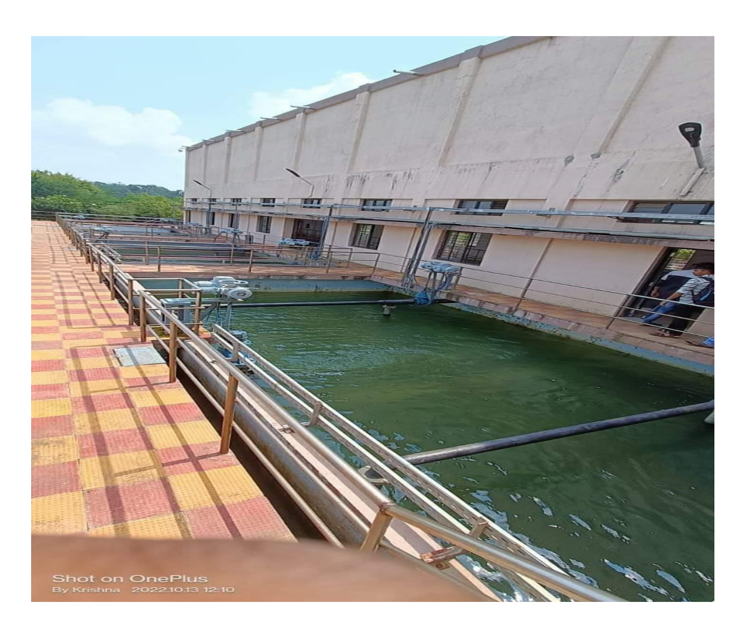
Rapid Sand Filter Under Regular Opearation