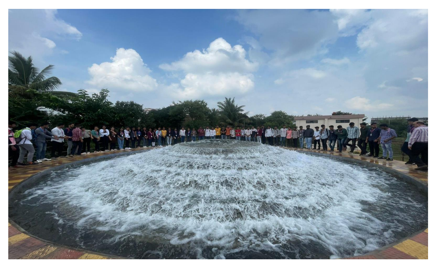
Cascade Aerator View at WTP