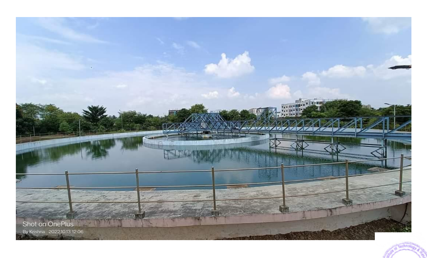
Clariflocculator View at Nilgiribaug WTP