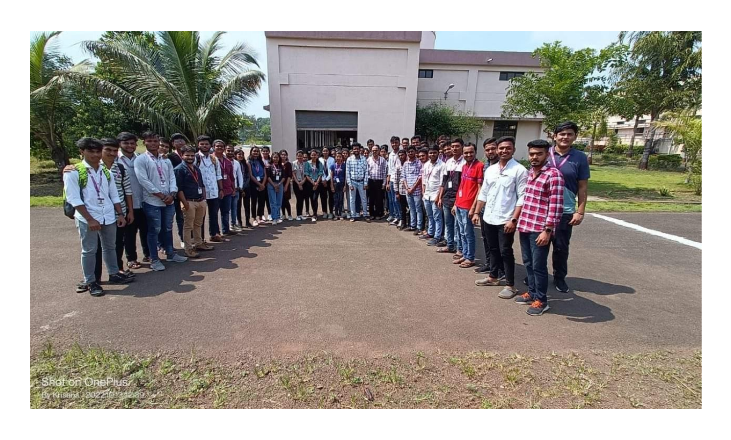
Group Photo with WTP Incharge