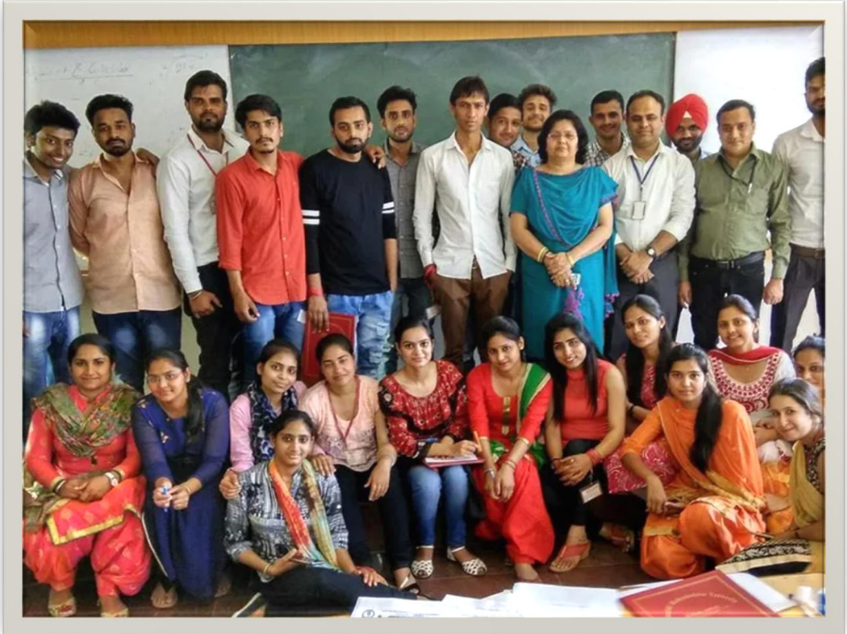
Alumni Meet Group Photo