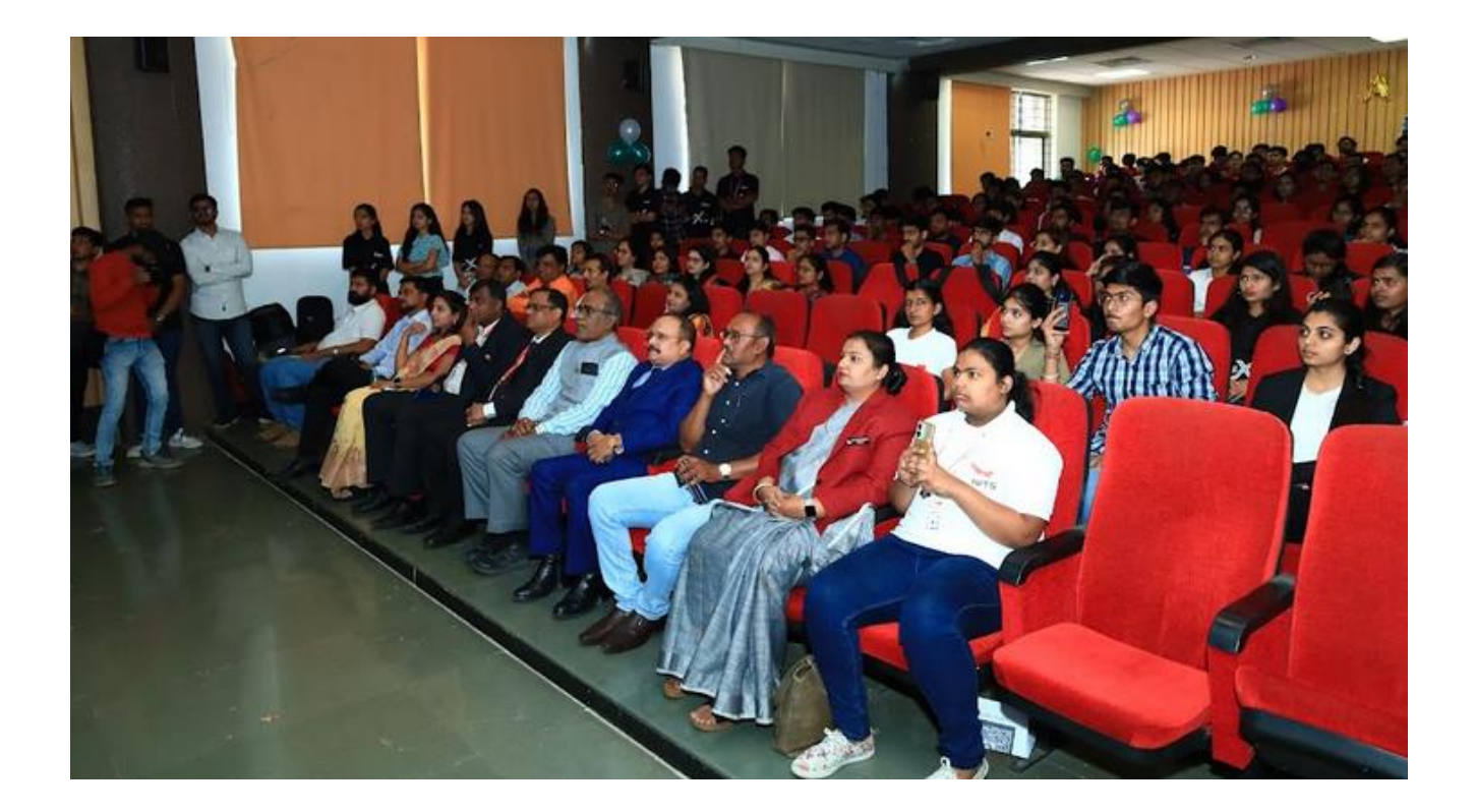
Alumni and Faculties During Alumni Meet 2019-20