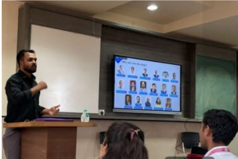
Alumni Dnyanesh interaction during meet