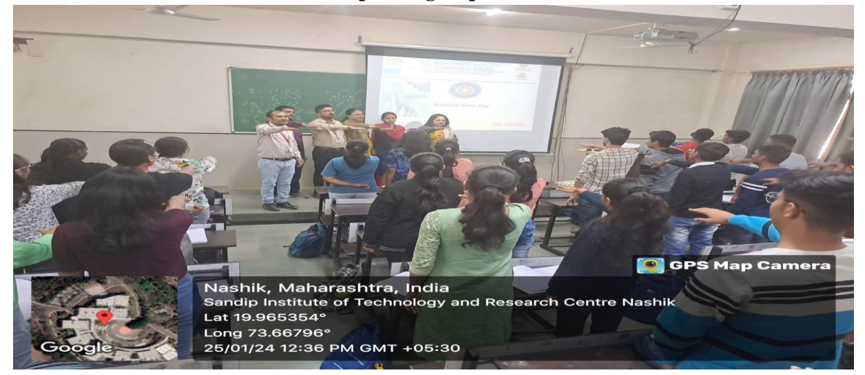
Students Taking Pledge on Voters Day