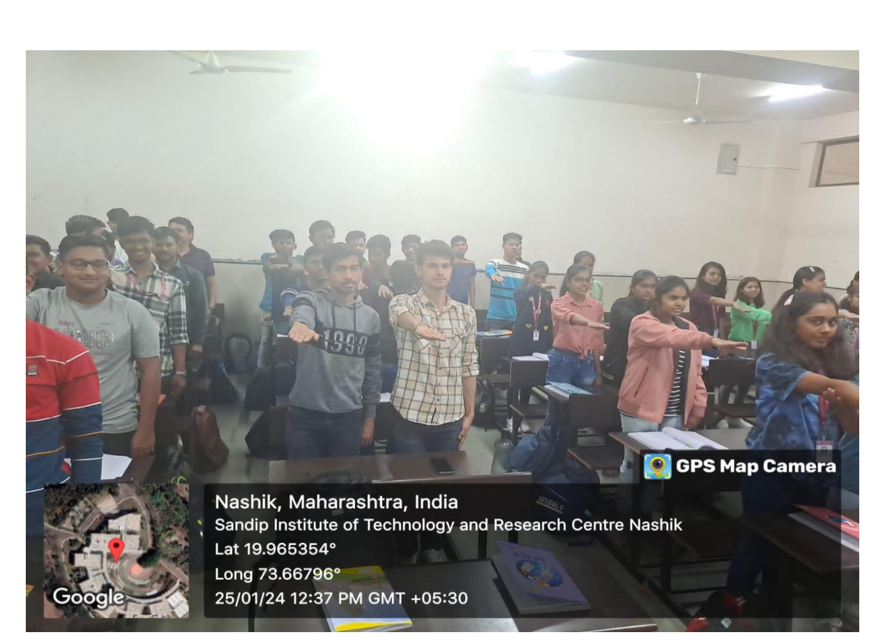
Students Of F.Y.B.Tech taking Pledge on Voters Day