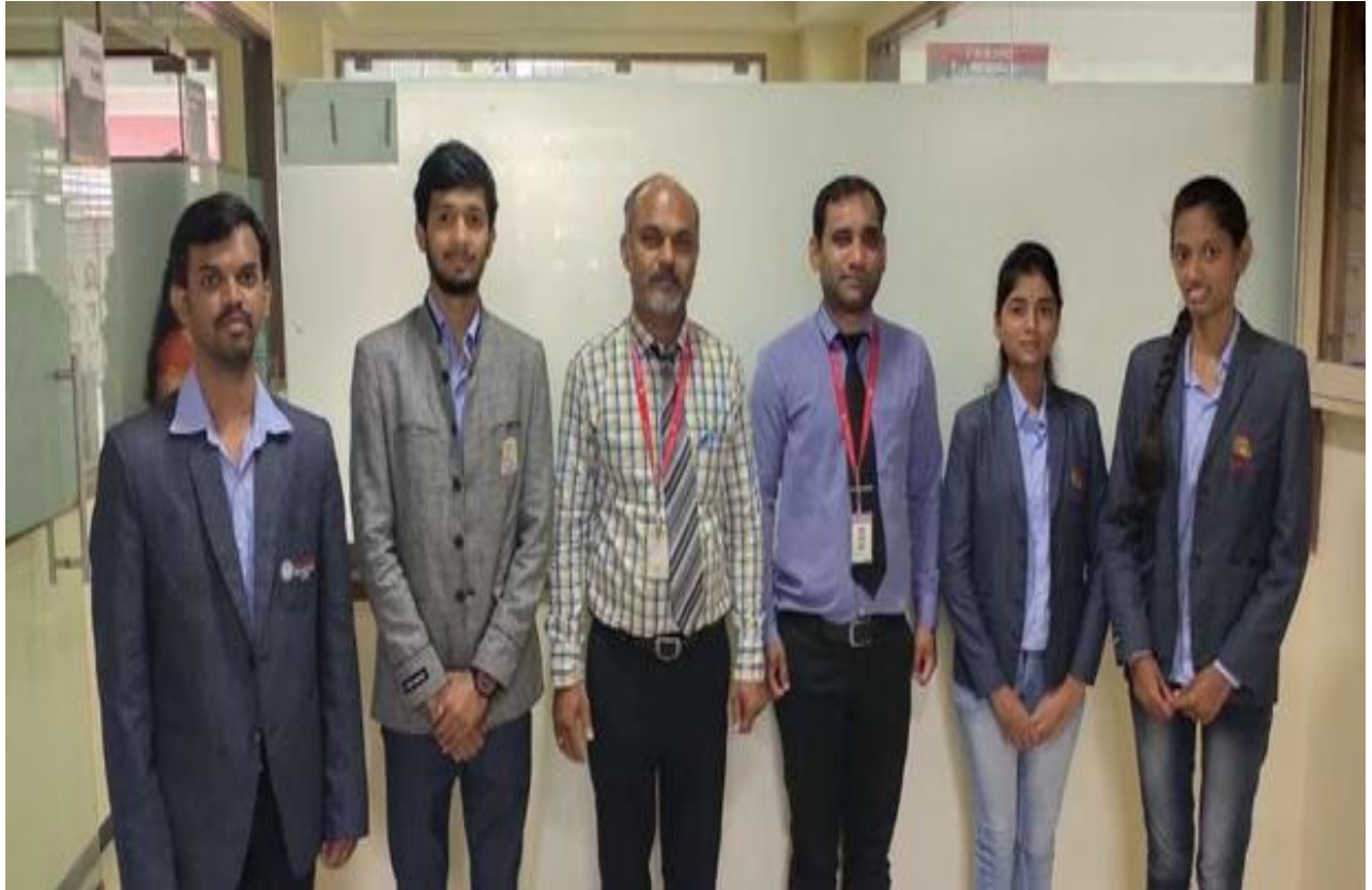
Photos- After Conducting The Session Of Value Added Program on Orion - 2018