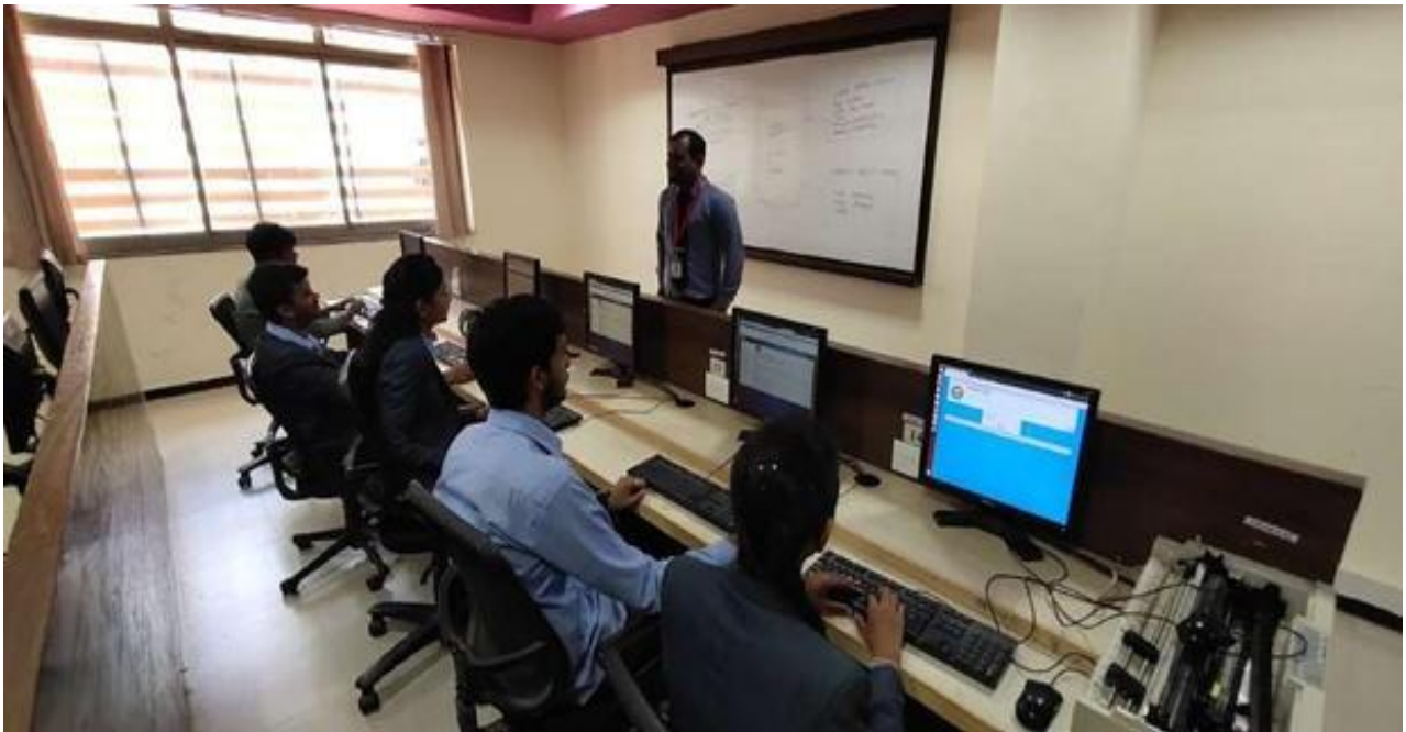
Student Photo During Hands On Training On Value Added Program On Orion -2018