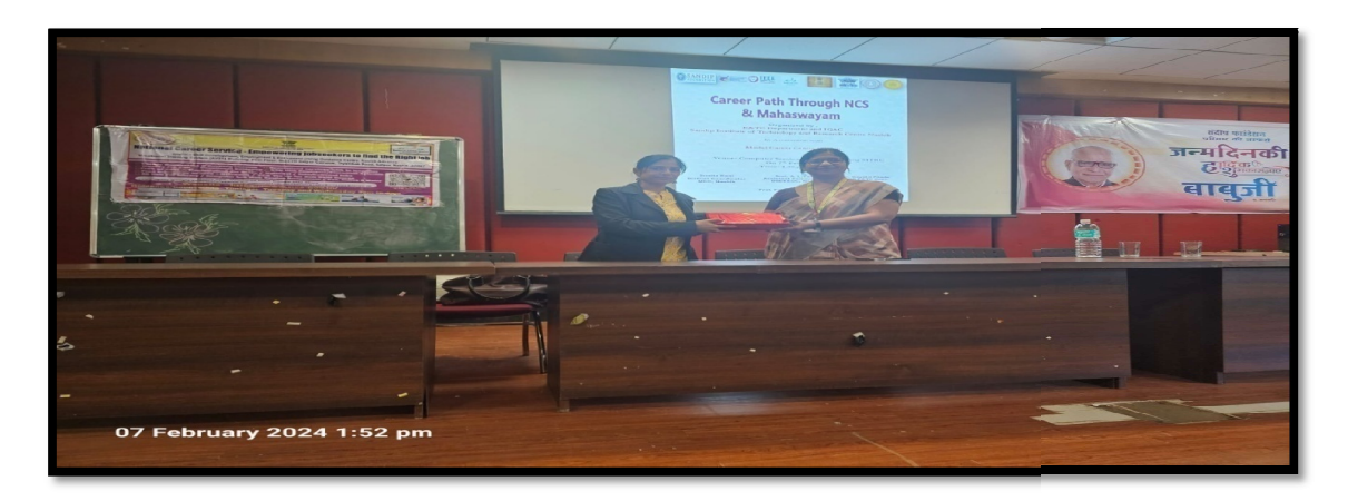
Some of the Moments from the Event