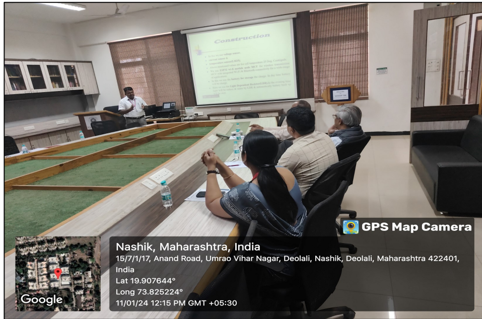
Participant presenting his innovative idea in Innovation Week