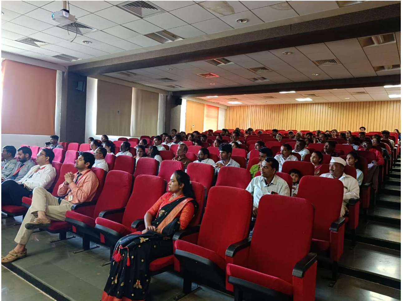
Photo 3: Parents of SE and TE Automation & Robotics attending Parent meet